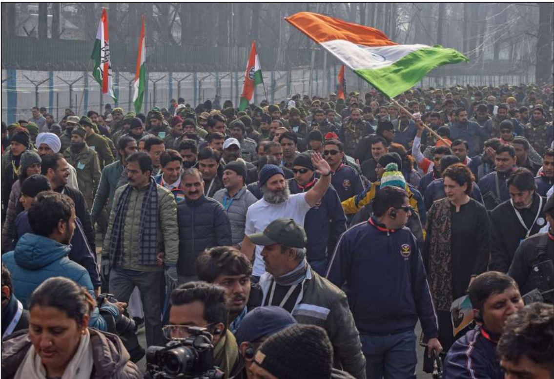
Congress leader Rahul Gandhi marches and waves during the Bharat Jodo Yatra on Sunday.

The DC asked the Revenue officials to carry out routine works in an efficient manner and ensure prompt delivery of services to people in a hassle free manner.