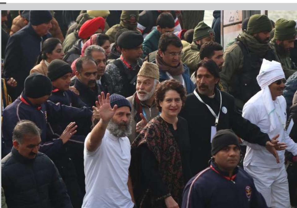
RAHUL GANDHI FLANKED BY HIS SISTER PRIYANKA and other Congress leaders waves at a crowd during the last leg of Bharat Jodo Yatra that concluded in Srinagar on Sunday.