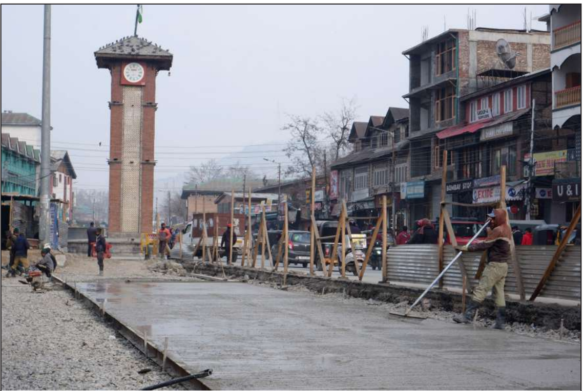
Despite harsh weather conditions, work on the Smart City projects is going on in full swing. KO Photo Abid Bhat