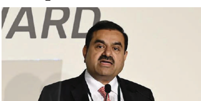
had alleged group companies to tion, money laundering and acbe involved in stock manipula-