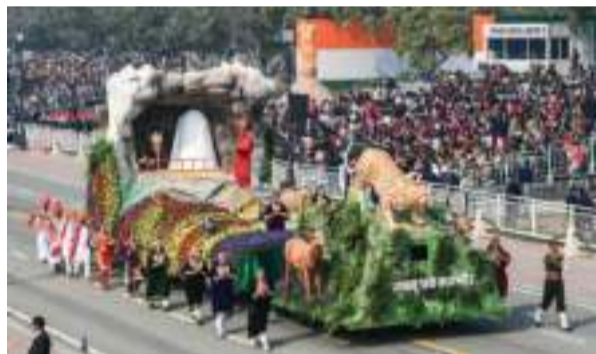
Jammu and Kashmir tableau showcased new era of development, tourism potential at R-day parade on Thursday