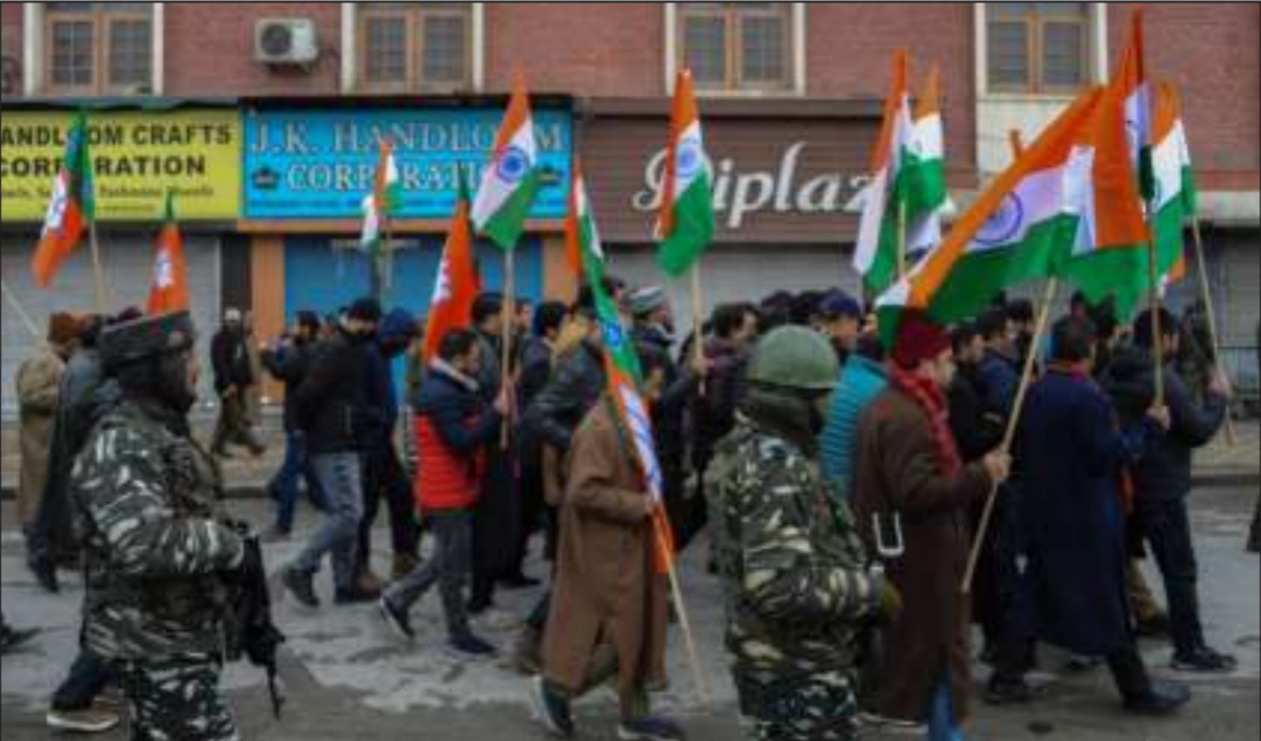
On the eve of India's 74th Republic Day, BJP members took out a Tiranga Rally at Lal Chowk.