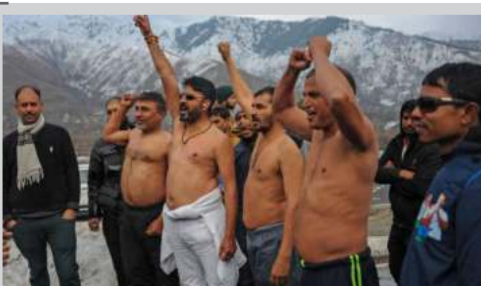
UNFAZED BY THE NAIL BITING COLD, shirtless Congress activists shout slogans in support of Bharat Jodo Yatra in Banihal on Thursday.

At present, about 13000 ASHAs and ASHA Cadres have been working in the UT of J&K and about 300 officials of Programme Management Units are working at block and district level.