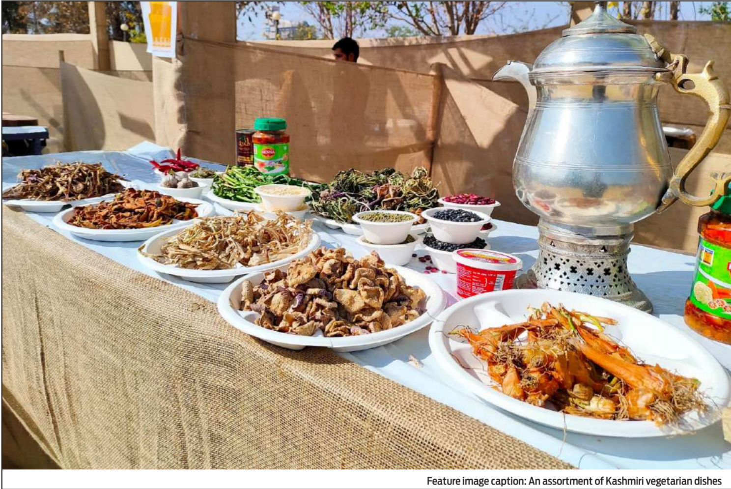
Feature image caption: An assortment of Kashmiri vegetarian dishes

One biggest indicator of the new normalcy, as highlighted by the home minister, has been the growth of tourism. And last year is said to have broken all previous records. According to the tourist officials, the number of tourists Kashmir received this year is the highest so far, beating by far even the pre-turmoil period record. This has generated employment for the thousands of people who had lost their jobs during Covid pandemic. Going forward, the situation looks set to only improve further, hopefully with all other political and social drivers of the place remaining unchanged.