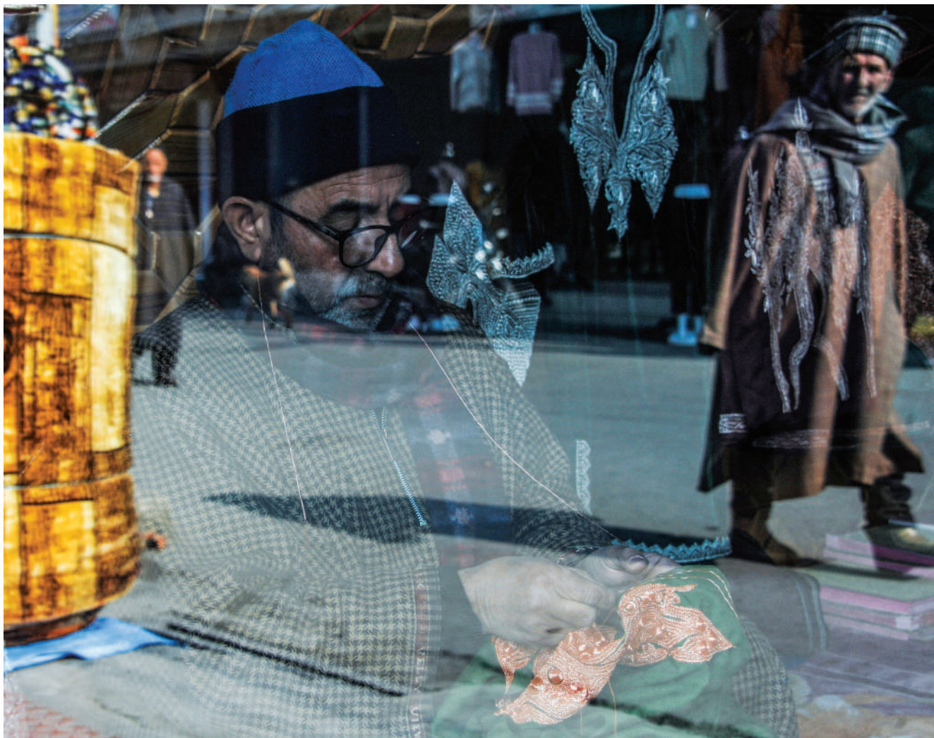
An artist busy weaving gold and silver threads into a silk pheran, while a passerby looks at his work through a glass frame in the Old City of Srinagar.

A civilian sustained injuries in a grenade attack carried out by militants in the Eidgah area of the city Sunday evening. Back-to-back blasts had rocked the Narwal area in Jammu on More on P6