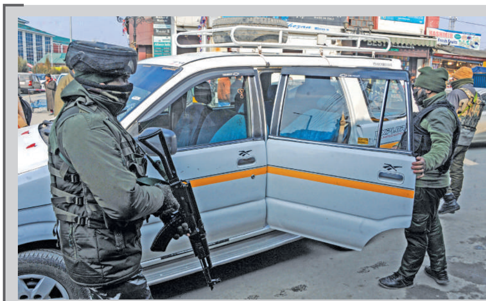
SECURITY FORCES HAVE INTENSIFIED random search operations in Srinagar and elsewhere in view of R-Day..

He said that the President, AJKPC also expressed his gratitude to the Lt Governor led UT-administration for providing liberal funding, besides formulating favourable policies for driving the developmental transformation in the rural areas of J&K.