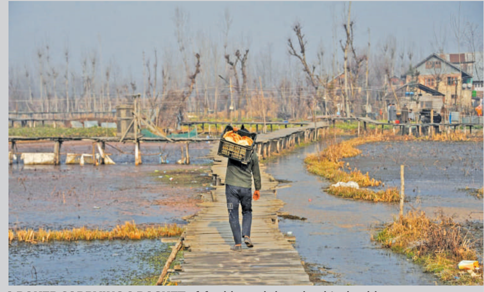
A BAKER CARRYING A BASKET of freshly made bread on his shoulders, passes through a wooden bridge in the interiors of Dal Lake.