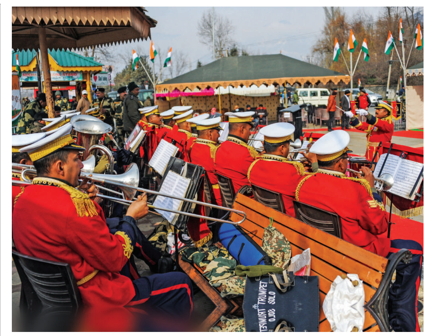
The musical band of Border Security Force (BSF) organised a musical show on the banks of Dal Lake on Wednesday and performed renditions of the patriotic songs, days ahead of Republic Day.

The final electoral roll of Jammu and Kashmir was published on November 25 last year, paving the way for the Assembly polls, the first since the provisions of Article 370 of the Constitution were abrogated in 2019 and the erstwhile state was bifurcated into Union territories. The revision of the electoral roll was carried out after a gap of nearly three years. It was last carried out with reference to January 1, 2019 as the qualifying date. The electoral roll More on P6