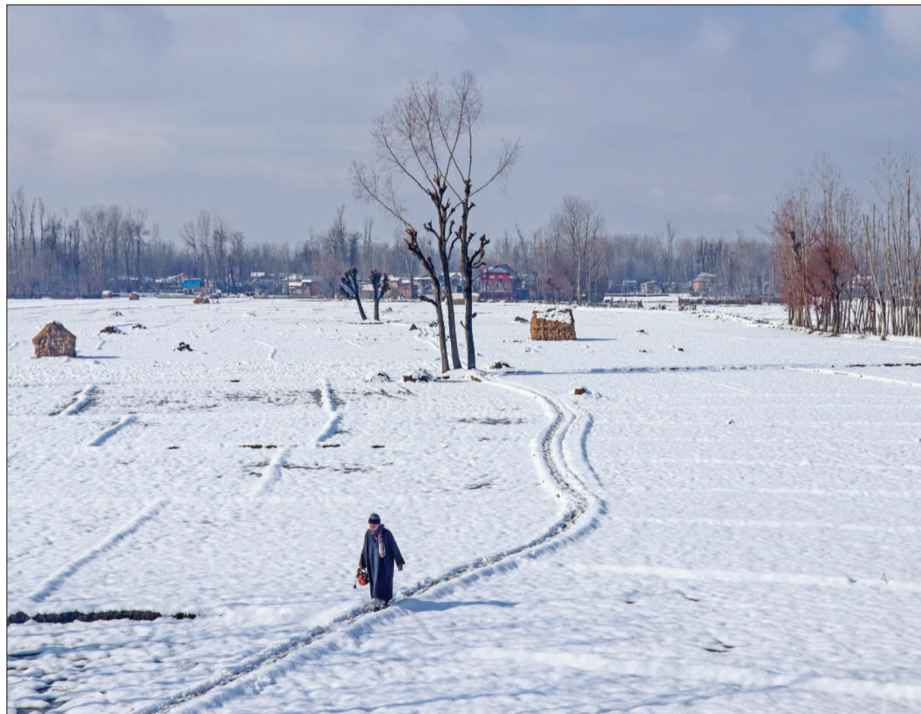
A man walks through a paddy field covered by a thick layer of snow in South Kashmir's Anantnag district on a sunny Tuesday afternoon.

"To a question on whether the Yatra will be allowed on foot, he replied that it will More on P6