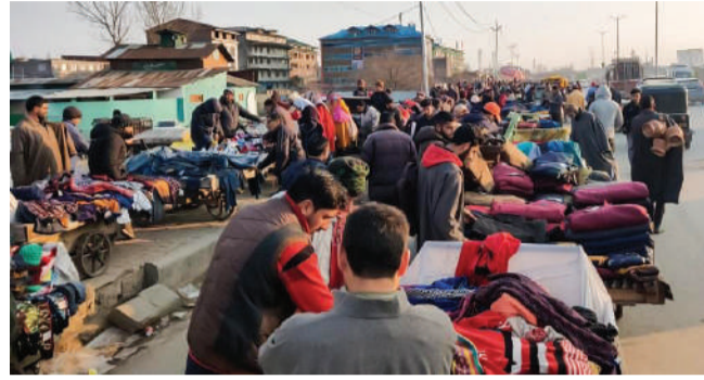
stopped the practice in June 2021 after moving to e-office to ensure smooth functioning of the civil secretariat in the twin

The Lieutenant Governor Manoj Sinha-led administration