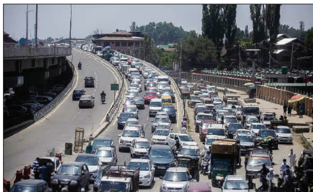
“The car business has indeed flourished in the Kashmir Valley. There is not a single day when we don’t provide car

An official from Jammu and Kashmir Bank said that the car loan cases have increased from the last ten years.