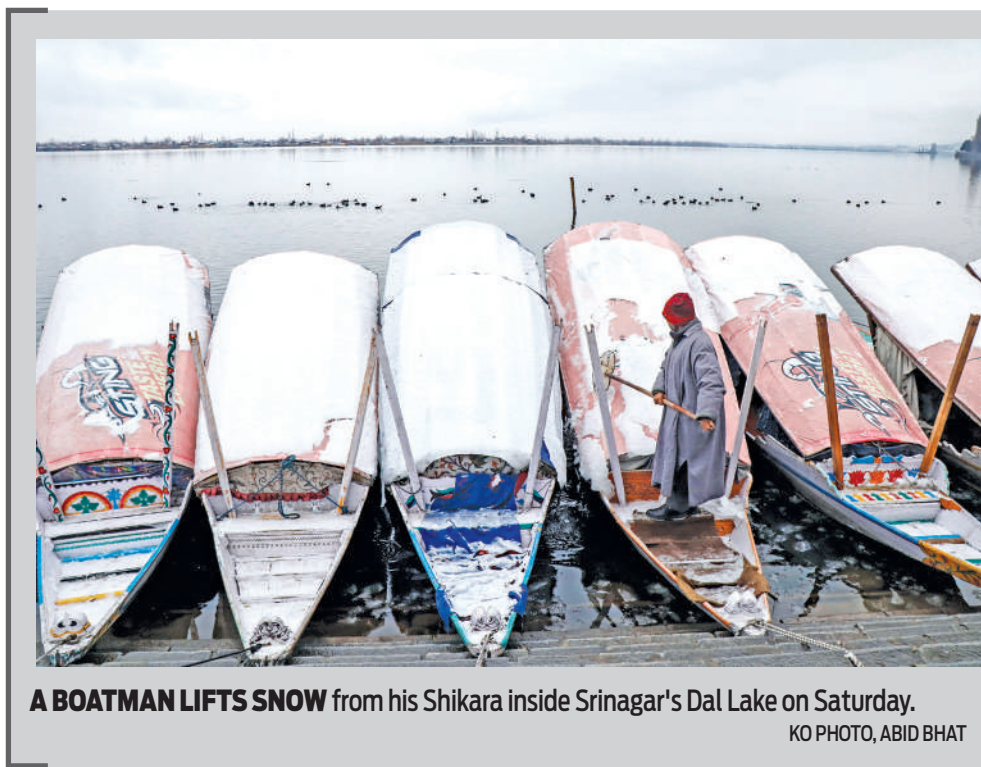
A BOATMAN LIFTS SNOW from his Shikara inside Srinagar's Dal Lake on Saturday.