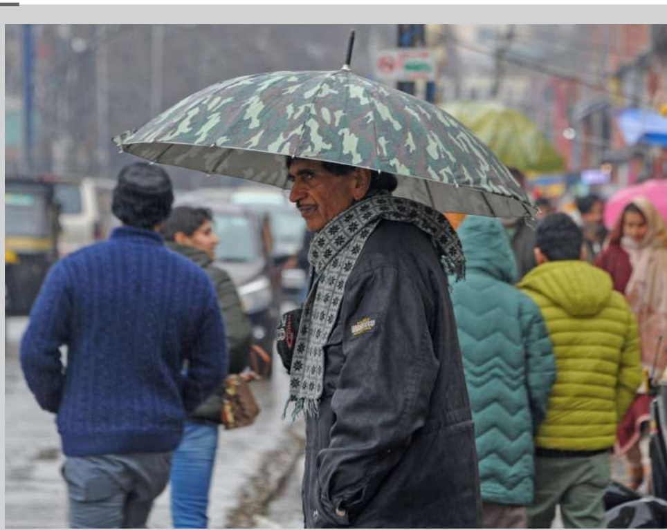
A MAN WAITING FOR A BUS ON A RAINY DAY Wednesday near Srinagar's busy Residency Road..

The Director, after taking stock of works in the district directed all the officers to keep a close liaison and coordination with PRIs so that implementation of developmental activities is ensured in a hassle free manner and people can realize the actual and intended benefits of work.