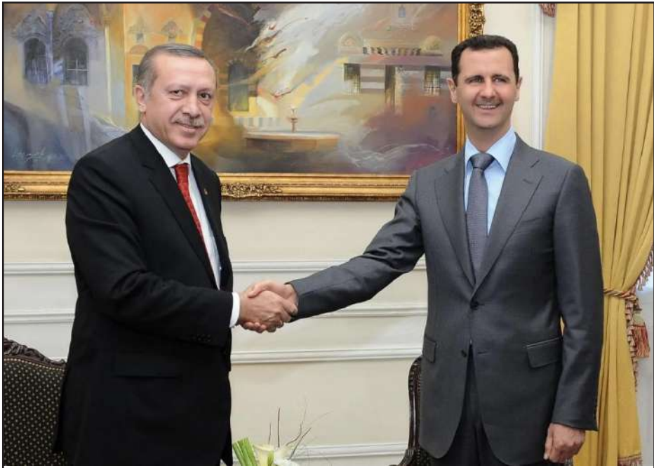
Syrian President Bashar al-Assad (R) shaking hands with Turkish Prime Minister Recep Tayyip Erdogan during a meeting in Aleppo, Syria, on 6 February 2011

UAE has moved closer to Assad, with the Syrian president visiting the country last year, his first trip to an Arab state since the start of the civil war. The visit signalled strongly that Gulf leaders who initially supported a rebellion against him are ready to welcome Damascus back into the Arab fold.