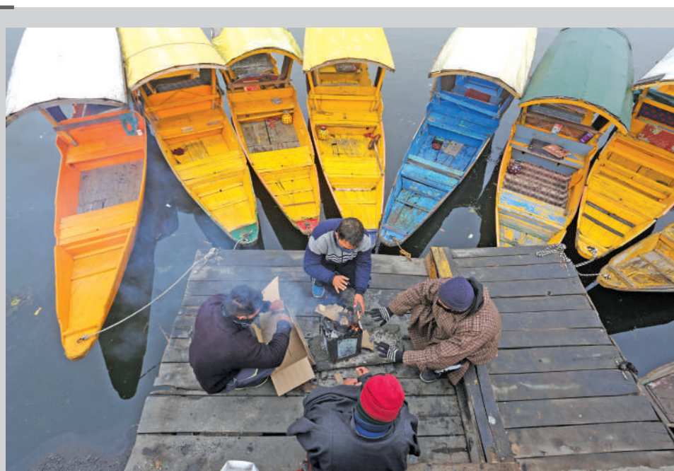
SHIKARA OWNERS WARM THEIR HANDS on the banks of Dal Lake on a cold Saturday morning.

"Mother Mary's statues were vandalised at many places when Christmas was celebrated. This is not Gandhi's India, but Godse's," she said while replying to a reporter's question about her mother's remarks that the country today is not the same to which J-K acceded to.