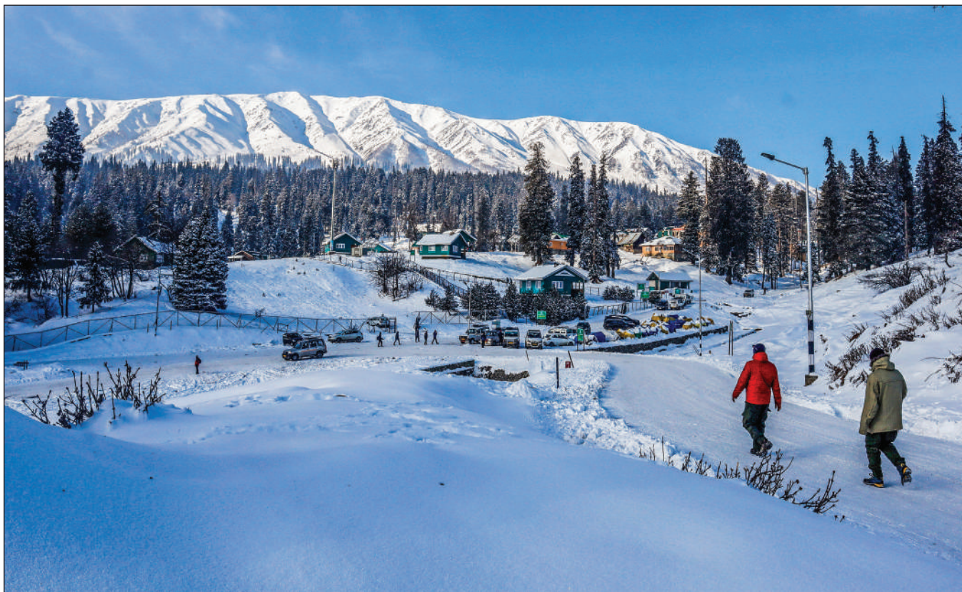
Gulmarg presents a fairytale view these days.