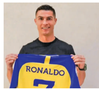
technical staff, club spokesman Al-

The 37-year-old great, a five-time winner of the Ballon d'Or, will arrive late on Monday with his family together with media and