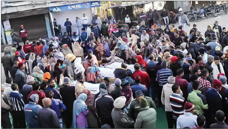
Family members mourn near mortal remains of four civilians, who were shot dead on Sunday evening, in Dhangri area of Rajouri.