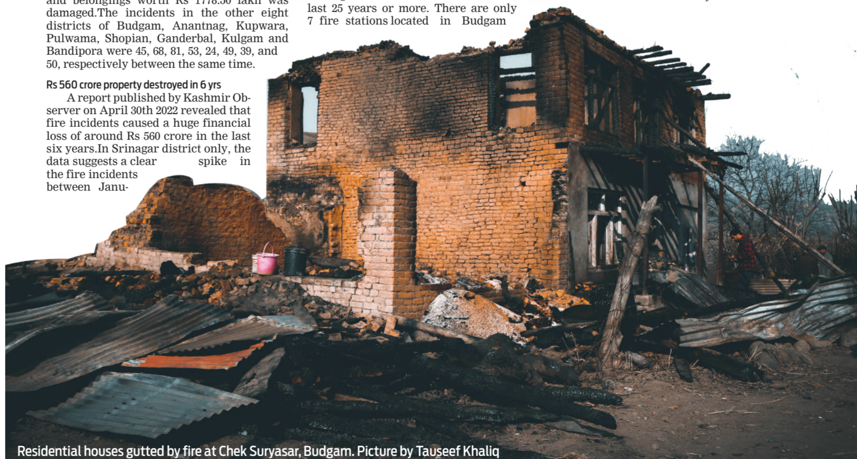
Residential houses gutted by fire at Chek Suryasar, Budgam.

Views expressed in the article are the author's own and do not necessarily represent the editorial stance of Kashmir Observer