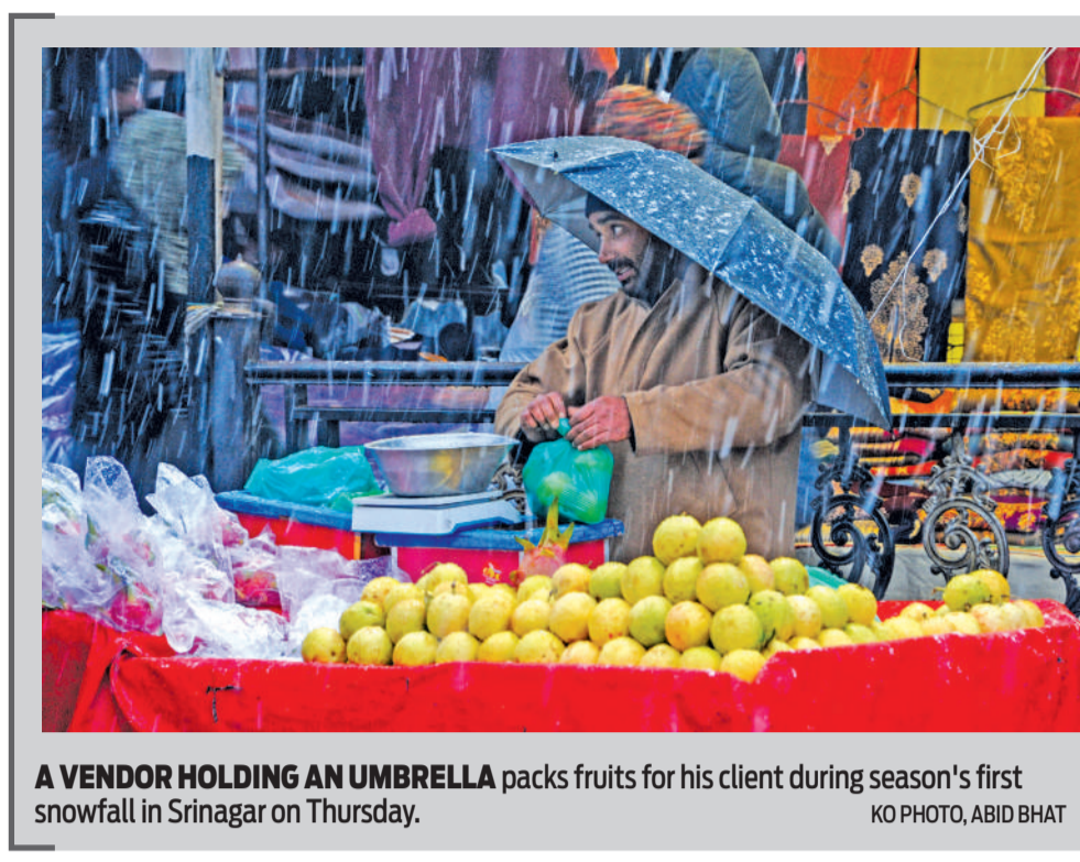
A VENDOR HOLDING AN UMBRELLA packs fruits for his client during season's first snowfall in Srinagar on Thursday.