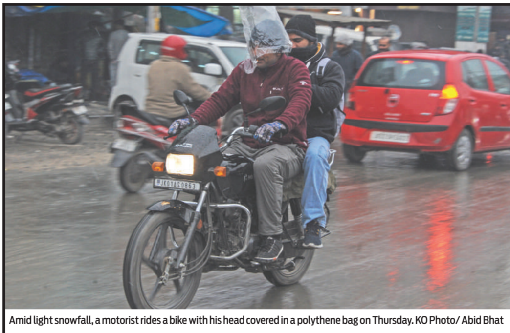
Amid light snowfall, a motorist rides a bike with his head covered in a polythene bag on Thursday.