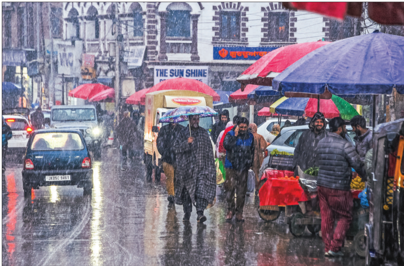
The plains in Kashmir Valley, including Srinagar received season's first snowfall on Thursday ending the prolonged dry spell.

Reports said that Gulmarg ski-resort, Pahalgam, Sonamarg and Gurez received fresh snowfall today. More on P6