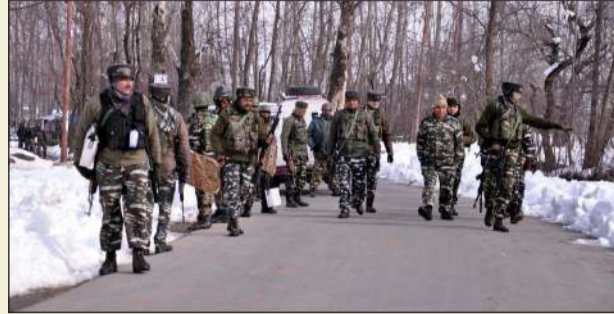
saw eight encounters which resulted in killing of 15 militants and among them eight were affiliated with LeT

Data reveals that Kupwara district reported nine encounters resulting in killing of 16 militants including 12 affiliated with LeT and four with JeM. Baramulla district