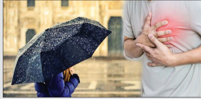
told Kashmir Observer. He further said chill narrows the blood vessels and arteries of the heart as a result the