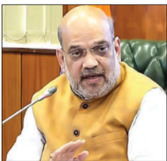
"A terror ecosystem comprising elements that aid, abet and sustain the terrorist-separatist campaign to the More on P6

New Delhi: Union Home Minister Amit Shah on Wednesday said the ecosystem in Jammu and Kashmir that aids, abets and sustains the terrorist-separatist campaign to the detriment of the well-being of common people requires to be dismantled. At a meeting here, Shah reviewed the functioning of the security grid and various aspects related to security in Jammu and Kashmir and gave directions to officials to follow the policy of zero tolerance against terrorism.