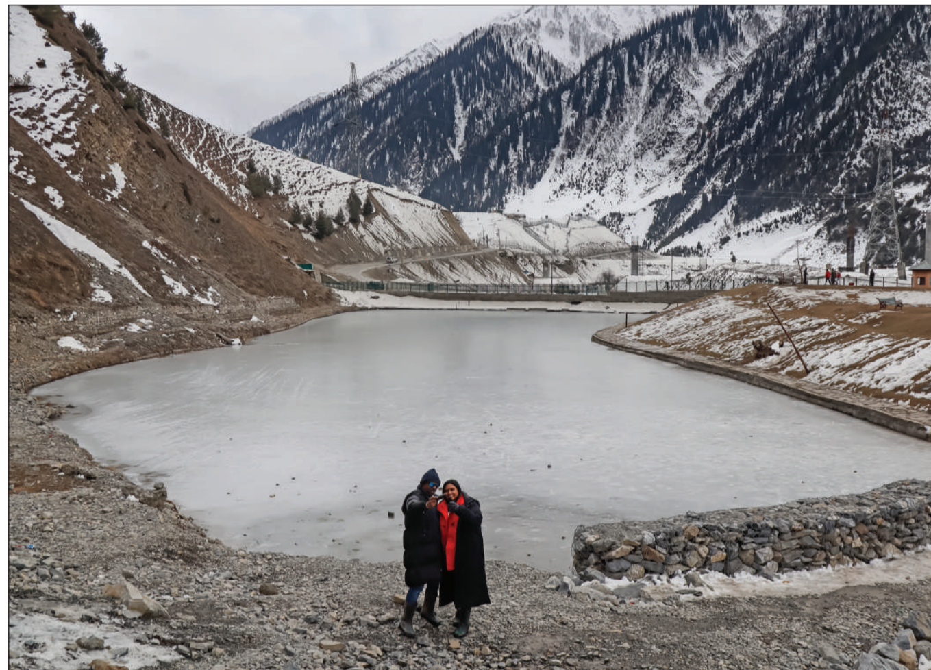
A tourist couple taking selfie near a frozen water body in the famous hill station of Sonamarg on Tuesday.

Wednesday, officials said. The counter infiltration grid has been put on high alert and security has been tightened in the region's border areas. Four terrorists, travelling in a truck to More on P6