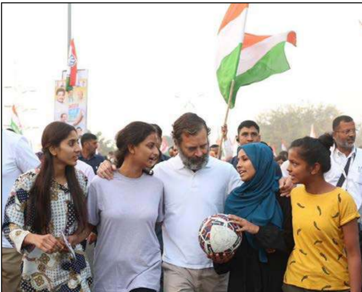
A college girl in hijab playing football with Rahul Gandhi Ji on the road of Nanded, Maharashtra

The yatra is a desperate measure for a desperate situation. Will it change anything for the better for Congress? Its true gauge will be the party's future electoral performance