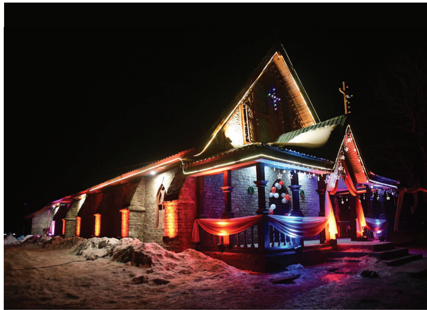
ST MARY'S CHURCH IN THE SNOW COVERED Gulmarg Valley was illuminated with colorful lights on Saturday on the eve of Christmas.

The department said that all the existing and prospective beneficiaries shall upload the necessary documents viz. age certificate, ration card and disability certificate etc. on the online portal ( https://jansugam.jk.gov.in/ ) in order to receive financial assistance More on PIO