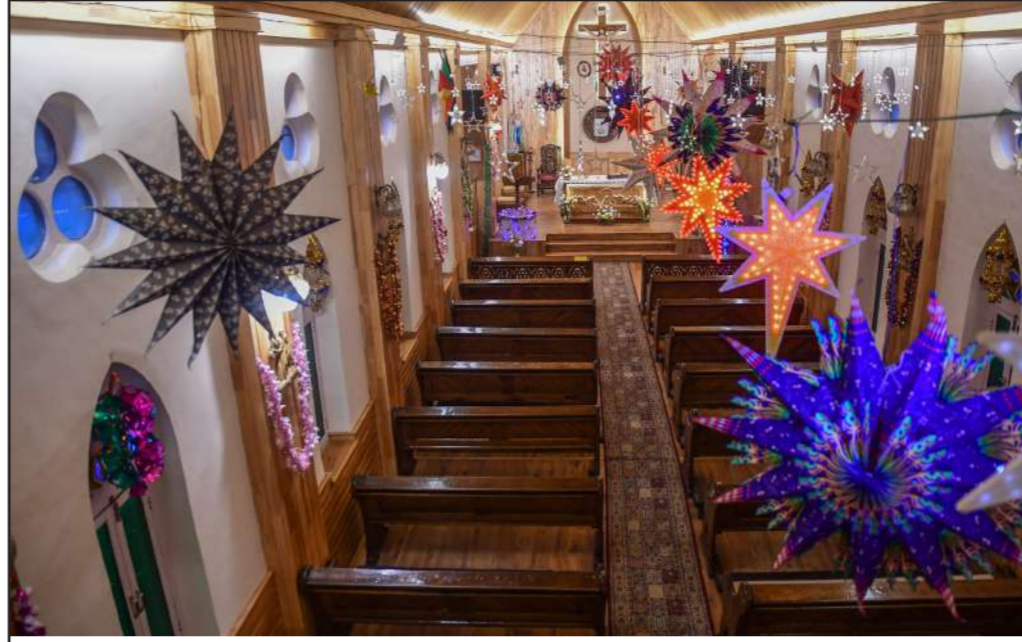
An inside view of Holy Family Catholic Church decorated on the eve of Christmas festival.