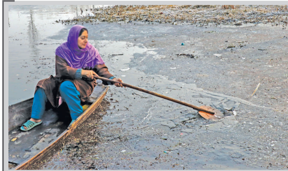
A WOMAN BREAKS ICE to row her boat in the interiors of the frozen Dal Lake on Saturday..

On the disclosure of the accused, a knife has also been recovered, he said.