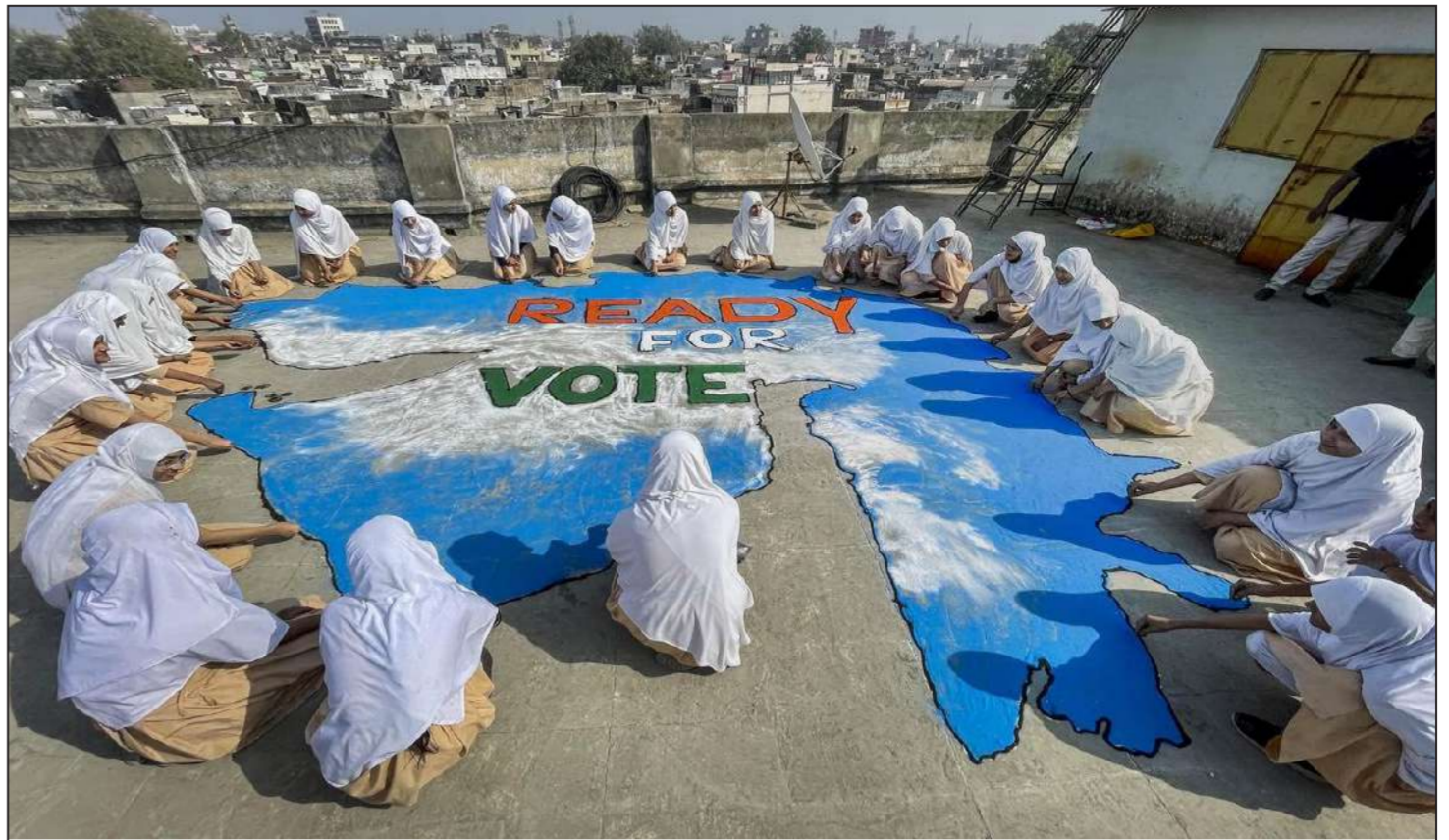
Feature image caption: Students create a 'rangoli' to spread voting awareness ahead of upcoming Gujarat Assembly elections, in Ahmedabad on November 17, 2022.