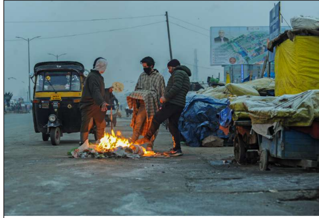
People warm themselves on the first morning of Chillaal Kalan on Wednesday.