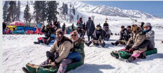
Pahalgam have achieved 90 percent occupancy, a week ahead of the New Year. The bowl shaped Valley of Gulmarg

Officials told Kashmir Observer that hotels in the hill stations of Gulmarg and