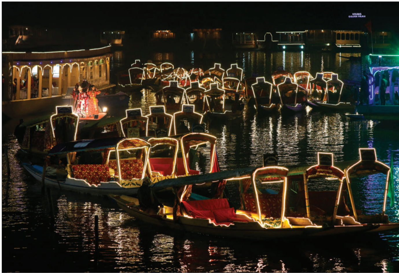
Illuminated Shikaras row inside Srinagar's Dal Lake on the beginning of two-day houseboat festival that started on Wednesday.

"A fresh Western Disturbance is likely to affect J&K and adjoining areas from December 9. Under the influence of the system, there is a possibility of More on P6