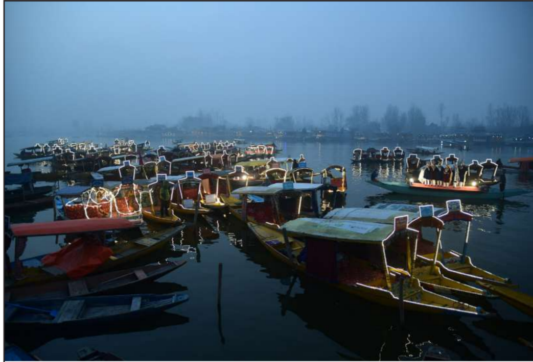
Shikaras illuminated with LED lights on the eve of Houseboat Festival at Dal Lake.