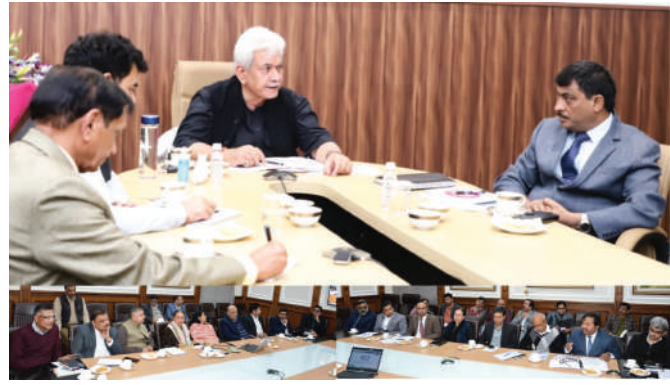
Observer News Service

Says Cities Can Be Transformed Into Vibrant Urban Economic Centres With Active Public Participation