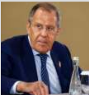
NATO of trying to ratchet up

Russia's top diplomat, speaking on Thursday during his annual news conference in Moscow, also accused the United States and