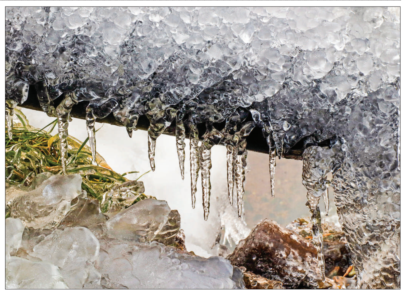
Icicles formed over a water supply pipeline in the tourist spot of Drang in Tangmarg due to falling mercury.

He said that fear, corruption and dynasty rule in Jammu and Kashmir for a long time had caused damaged to the social setup here, but during past 2-3 years, there has been a great change. "The effort is to bring major positive changes in social setup in J&K."