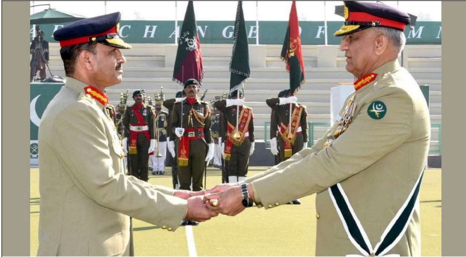
Feature image caption: Outgoing Chief of Army Staff General Qamar Javed Bajwa hands over the baton of command over to the newly appointed Army Chief General Asim Munir (L), during a ceremony at the army headquarters in Rawalpindi, Pakistan, on 29 November 2022

During General Qamar Javed Bajwa's term, Pakistan largely adopted a non-combative policy towards India. The key question is whether new Army chief General Asim Munir will change that