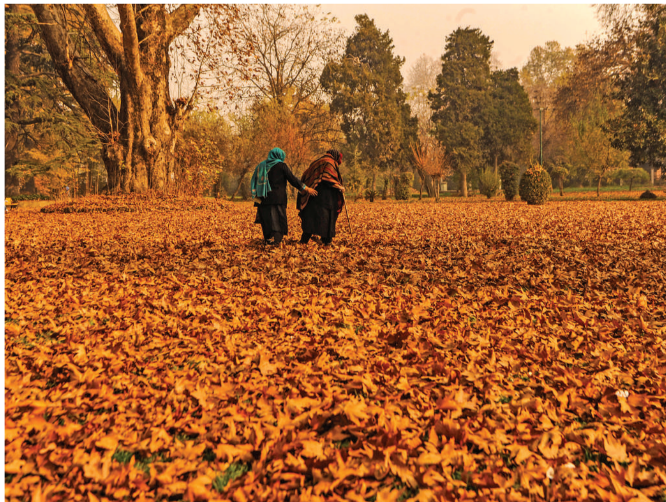
An elderly woman joined by her relative takes a stroll over the fallen leaves of might Chinar trees inside Srinagar's Arts Emporium.

"The recommendations implemented in the More on P6