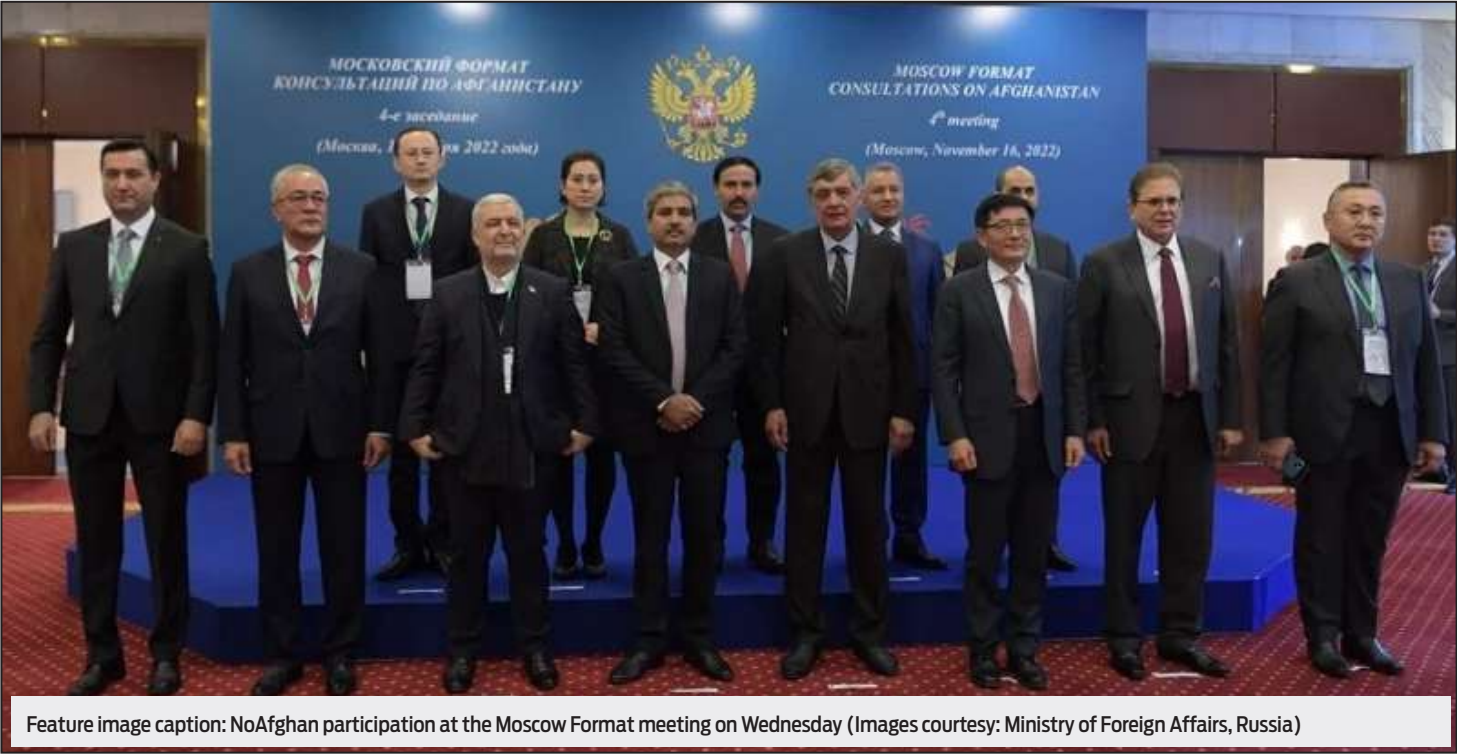
Feature image caption: NoAfghan participation at the Moscow Format meeting on Wednesday

The Moscow Conference on Afghanistan has shown the resolve of the regional players to play an effective role in the reconstruction of Afghanistan, and help the masses, who are facing a bleak future