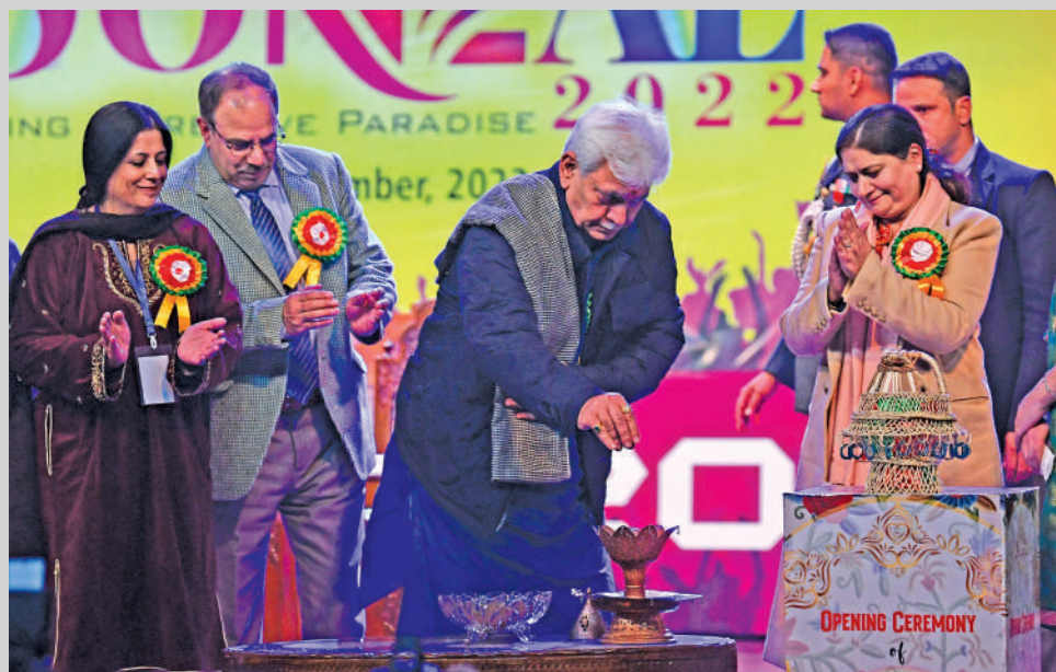
LIEUTENANT GOVERNOR, MANOJ SINHA lighting up lamp during the inauguration of Annual Youth Festival 'Sonzal-2022' at the University of Kashmir on Wednesday.

The CEO also said that the required information should reach its office by or before November-24 without fail.