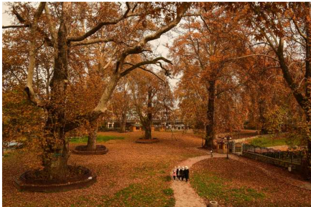
The Chinar Park in Srinagar presents a mesmerizing look as the leaves of majestic Chinar trees have turned crimson red in the autumn season.