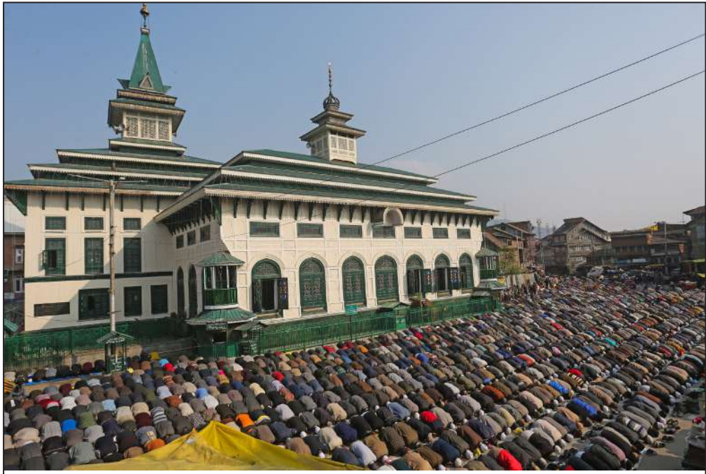
Thousands of devotees pray outside Dastgeer Sahib (R.A) shrine on Friday following the Urs.

She said while the University’s score in key indicators like Staff with PhD and Employer Reputation is quite good, the University has set in motion several measures to score better in other indicators.