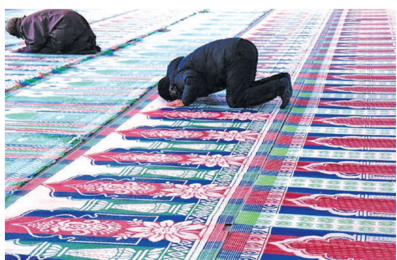
Many more had fallen in prostration inside the sanctified space. What looked like a regular act of worship had helplessness written all over it.