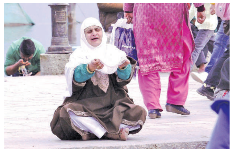
But it was an outside outpouring that had created a big entreating ecosystem. A mother had shown up in a quintessential kosher appearance, filing petitions in His supreme court. Her list was endless, but mostly driven by her family's health concerns. The mother's supplication was all about His Shifa.