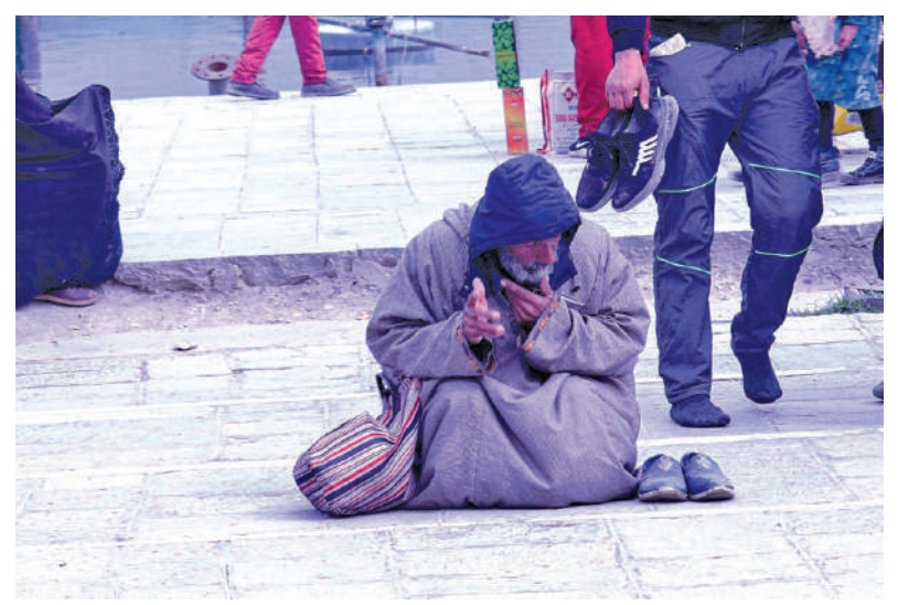
While the old man sought salvation in seclusion, a bearded man nearby had fallen on his knees. In the autumn of his life, he was seeking some spiritual sustenance to tackle the upcoming winter.