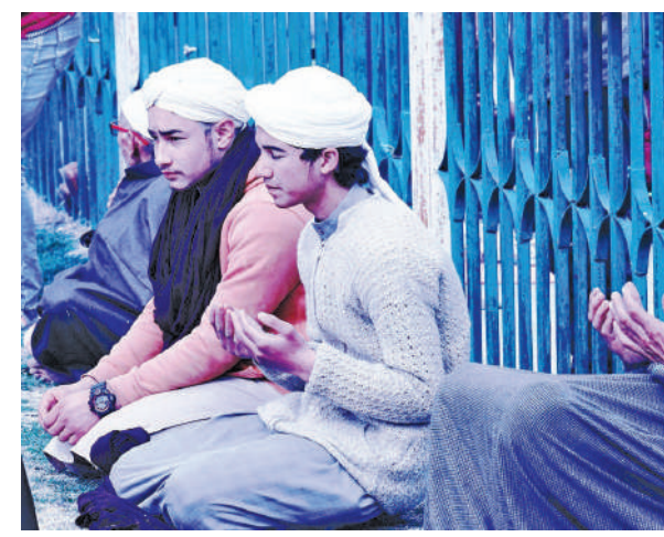
Rubbing shoulders were young Kashmiris—turbaned, caped and hatted—demonstrating their devotion as a collective act. The youthful congregation quietly cried for opportunities.