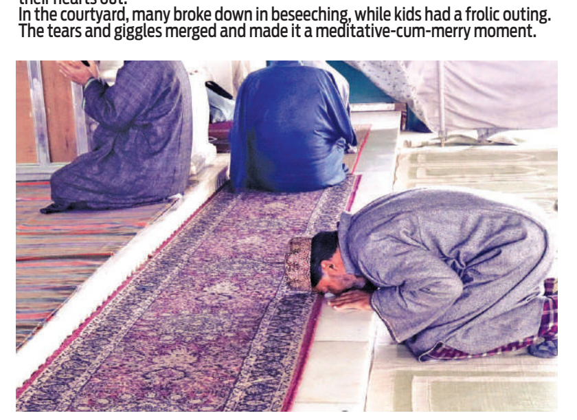
At the sanctum's doorsteps, one devotee was inconsolable. His image appeared of a mortal caught in the trials of life.