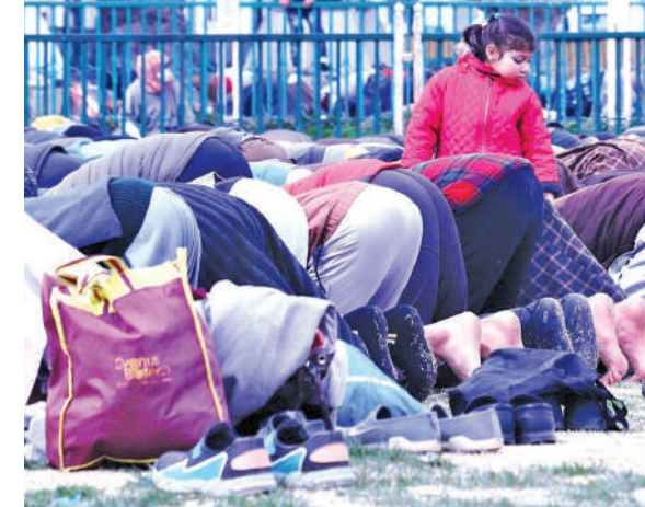
But what made the entire entreating assembly quite assuring was the presence and participation of budding Kashmir. They, as Ottomans reckon, make the future faithful