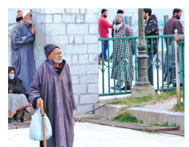
Not everyone, however, was shrilling their supplications. Some silent acts of worship were making the mood even more reflective. Among those silent supplicators was an old man with an unflinching gaze at the shimmering sanctum.