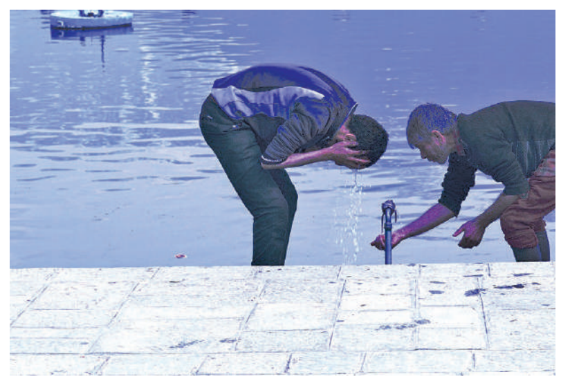
While the old man prayed, the ambiance of Kashmir's revered place was getting contemplative. The cleric broadcasted a soulful naat and made masses to pour their hearts out.