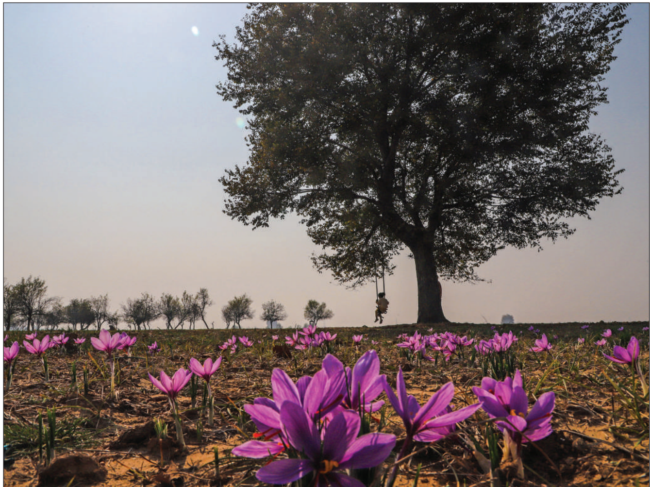
A girl plays with a swing in a vast saffron field in Pampore area of South Kashmir's Pulwama district on Tuesday.

6 TRAFFIC PLYING ON JAMMU-SRINAGAR NHW, Mughal road through. However SSG Road closed for vehicular movement in view of fresh snowfall in Zoji La axis."