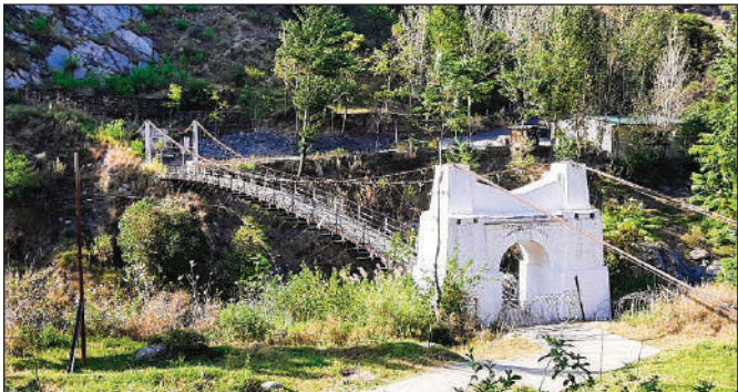
The 160-ft-long wooden suspension bridge over Kishanganga -- called Neelum in Pakistan -- is one of the four crossing

The bridge, constructed in 1931 by the then princely state of Jammu and Kashmir, has seen the bloody Partition in 1947 and the tragic human migrations that accompanied it, witnessed wars between India and Pakistan and see-sawing relationship between the two countries over the last 75 years.