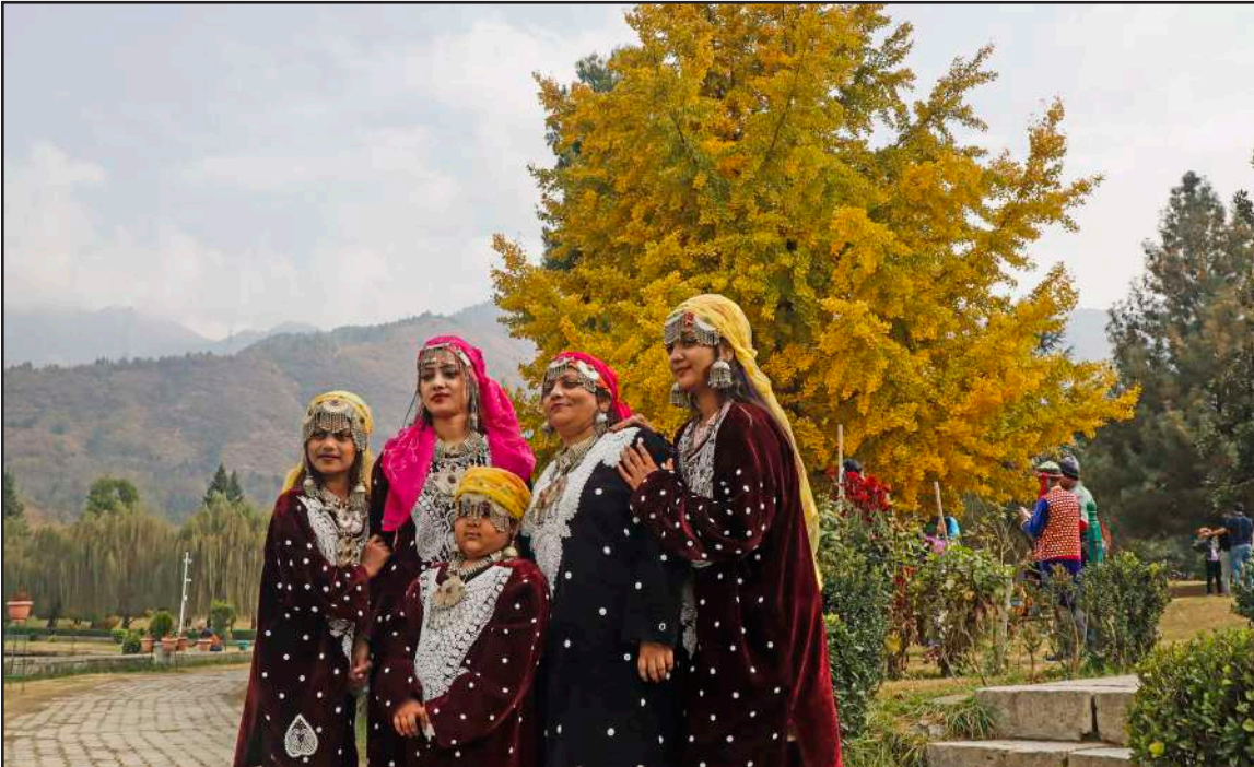
A group of female tourists pose for a photograph at the Botanical garden on Tuesday.

The recent outbreak of the LSD virus has killed over 1 lakh cattle and is still unabated. Each viral disease appears to be the result of unusual manifestations and proliferation of viruses previously known.