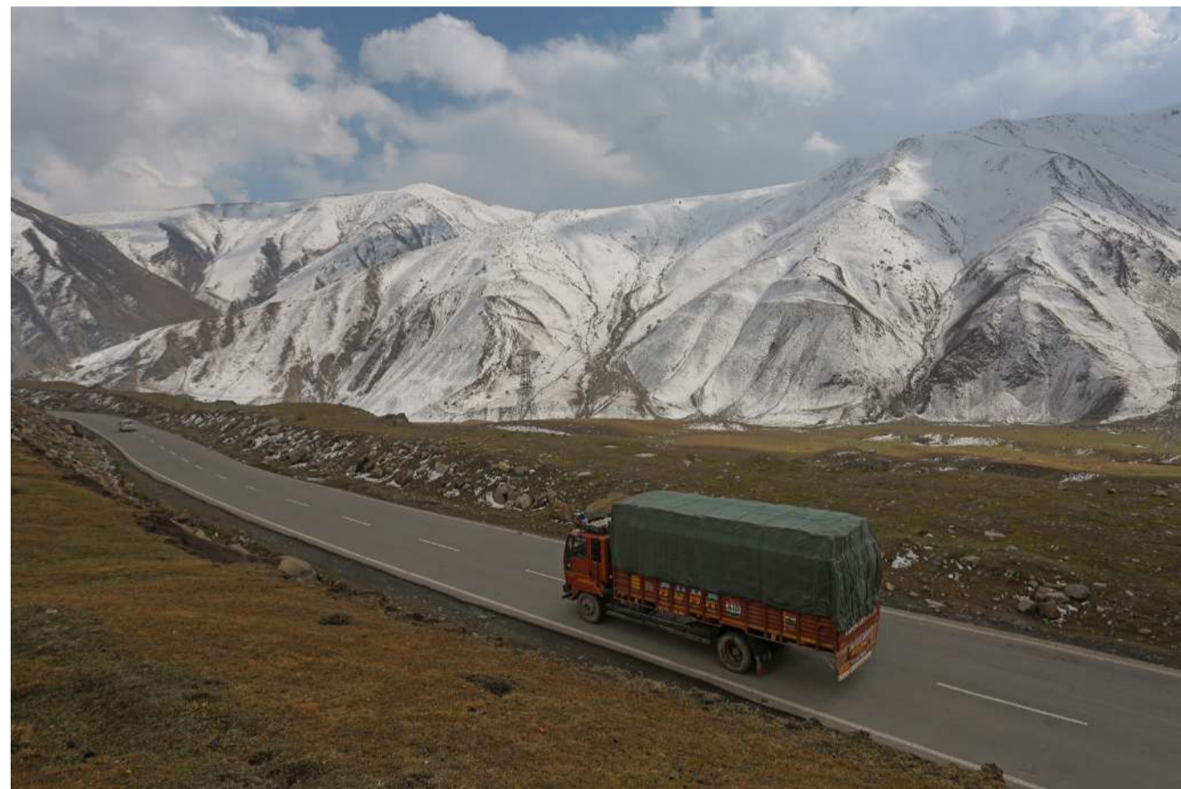
A TRUCK PASSES THROUGH SNOW-CAPPED MOUNTAINS along the Mughal road in Shopian district after the highway connecting the south Kashmir district with Poonch and Rajouri in Jammu division was thrown open for traffic on Saturday.

He commended the Northern Command for always being in combat while securing the borders and keeping the internal security situation stable in the union territories of Jammu & Kashmir and Ladakh. The Union minister | More on PIO