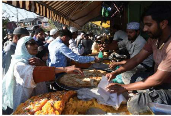
PEOPLE THROG STREET FOOD stalls outside Hazratbal Shrine on Friday following Eid-e-Milad.