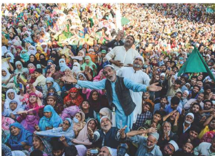
Devotees raise their hands in supplication as the unseen cleric of Hazratbal Shrine displays a relic believed to be from beard of Prophet Muhammad (SAW) on Friday following Eid-e-Milad.