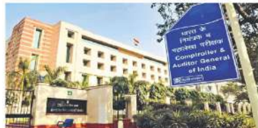
Territory of Ladakh," it said. The report said that Rs 32.50 crore were granted to J&K State

"Eerstwhile State Government had cumulative investment of Rs 4,617.16 crore in 38 Companies (Rs 4,348.83 crore), three Statutory Corporations (Rs 374.39 crore), eight Co-operative Institutions/ Local Bodies (Rs 47.83 crore), two Rural Banks (Rs 45.82 crore) and two Joint Stock Companies (Rs 0.34 crore) ending 30 October 2019 which had not been divided between Union Territory of Jammu & Kashmir and Union