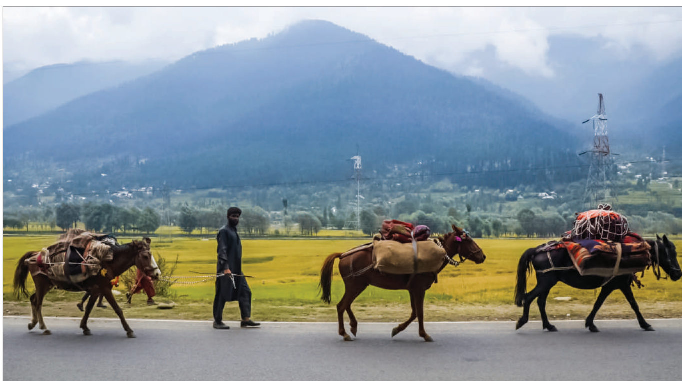
Nomads have begun their annual migration from the summer pastures of Kashmir Valley following a sharp decline in temperature