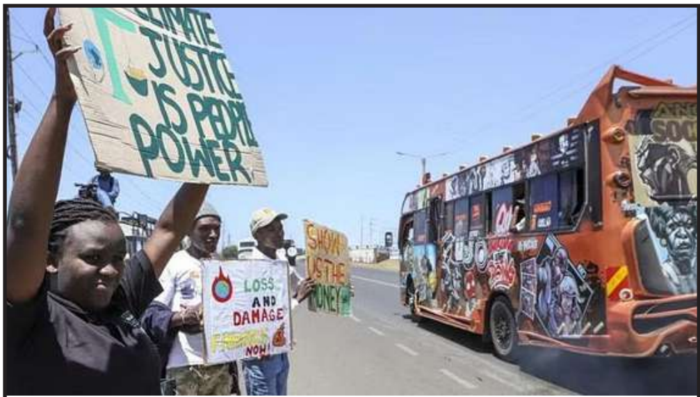
Kenyan activists demonstrate at a protest to highlight the effects of global warming and demand more aid for poor countries, in downtown Nairobi, Kenya Sept. 24, 2022.

He will celebrate Dussehra with soldiers at Auli and Mana, and will offer prayers at Badrinath Dham.