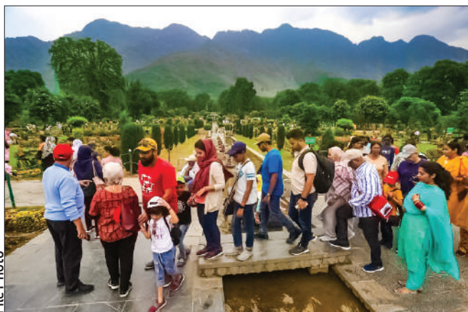
File Photo Tourist Visit (DTV), however, the Domestic arrival increased to 11314920 in 2021. The facts emerging from the data also

According to a report by the Union Tourism Ministry titled "India Tourism Statistics 2022", the domestic tourists' footfall in J&K increased by 349.09 percent in 2021 against 2020. The data shows that in 2020, J&K had received 2519524 Domestic