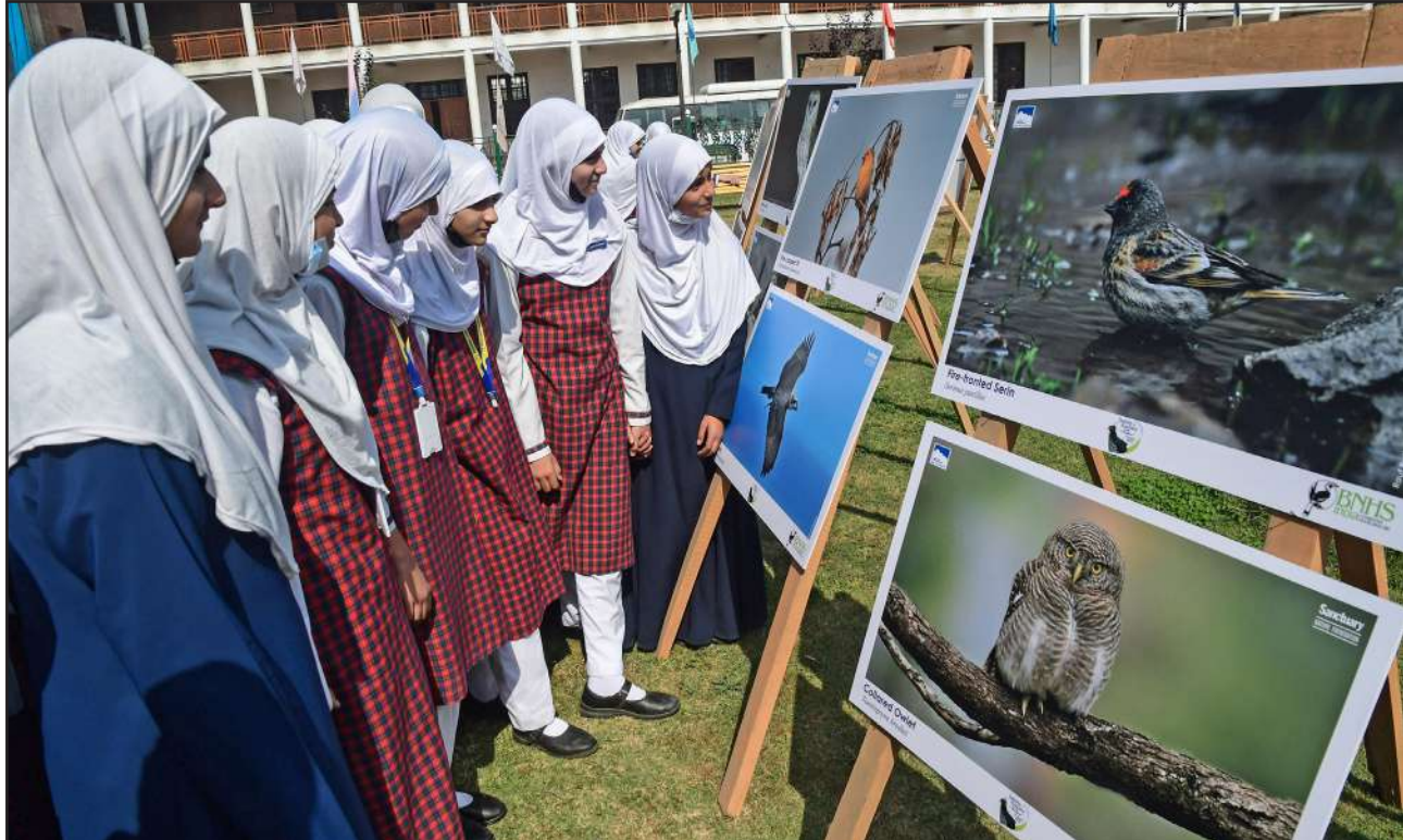
School students attend the first ever Bird Festival organized by the J&K Tourism Department on Monday.

Gram Sabhas with respect to village development plans were also conducted.