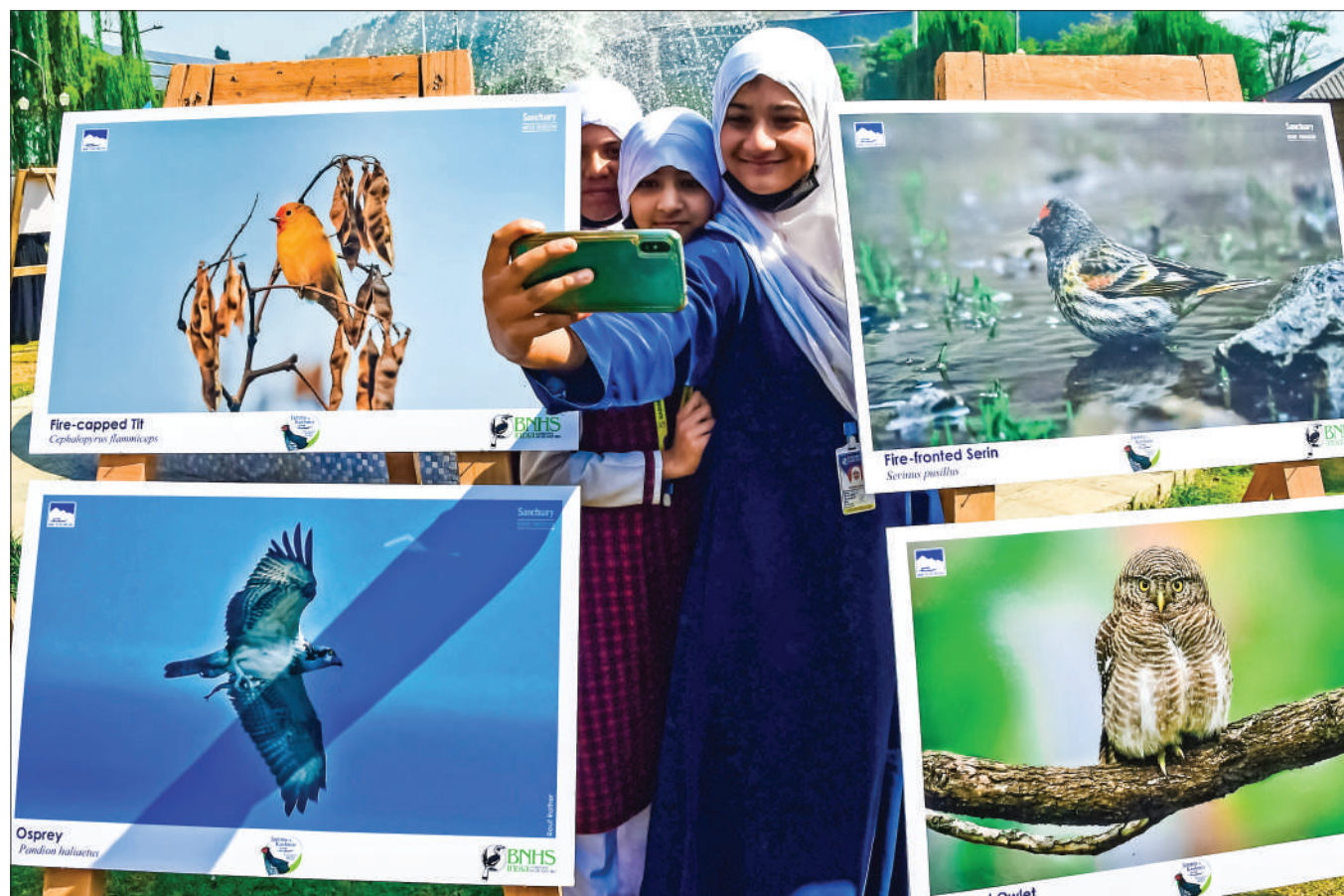
STUDENTS TURNED UP IN LARGE NUMBERS to witness the first-ever bird festival organised in Srinagar on Monday.

Several delegations, including representatives of the Dogra community, called on Union Home Minister Amit Shah on Monday after he arrived here on a three-day visit of Jammu and Kashmir, officials said. Lieutenant Governor Manoj Sinha and Union minister Jitendra Singh were | More on P10