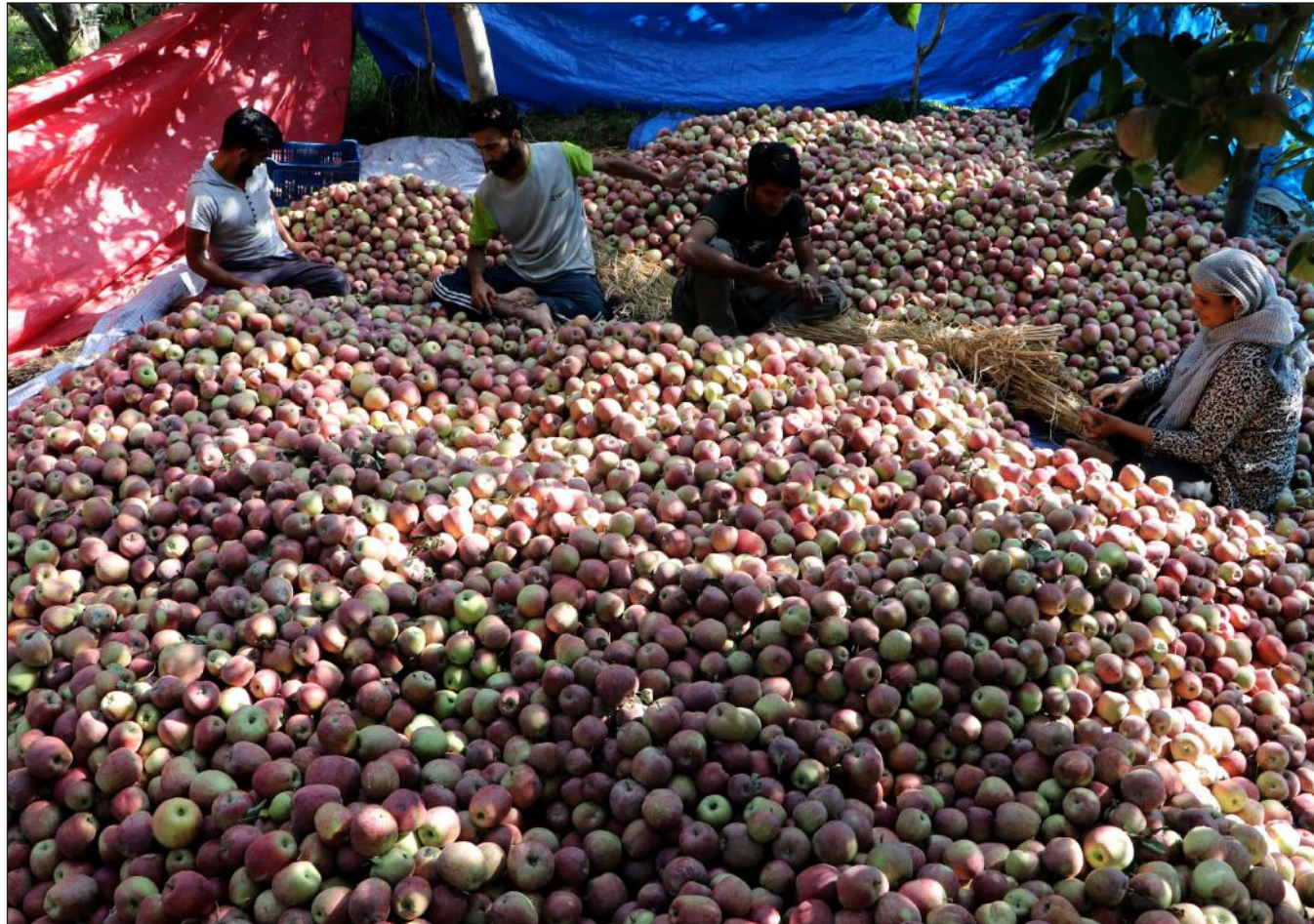
A farmer family sorting freshly harvested apples for grading and packing inside their orchard in south Kashmir's Anantnag district on Thursday

"The stand taken by project proponent (PP) is an admission of use of heavy machines for excavation. Once it is admitted that the boulders were such big sized, not capable More on PTI