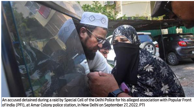
An accused detained during a raid by Special Cell of the Delhi Police for his alleged association with Popular Front of India (PFI), at Amar Colony police station, in New Delhi on September 27, 2022.

"Our investigation found that the PFI, which turned into action locally after the violence in Khargone, tried to instigate a particular community and collected about Rs 55 lakh donation from them in the name of helping the riot-hit people," Deputy Commissioner of Police (Intelligence