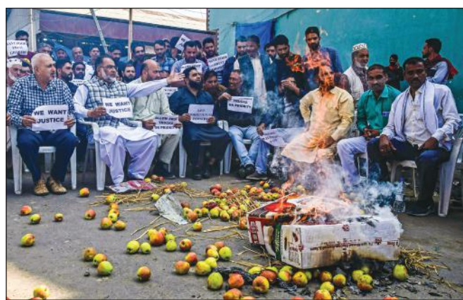
Fruit dealers holding a demonstration in Srinagar on Monday.

Members of the Fruit Growers Association held the protest demonstration at Parimpora fruit mandi and on