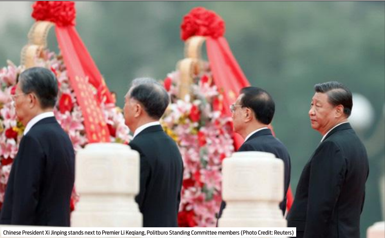
Chinese President Xi Jinping stands next to Premier Li Keqiang, Politburo Standing Committee members