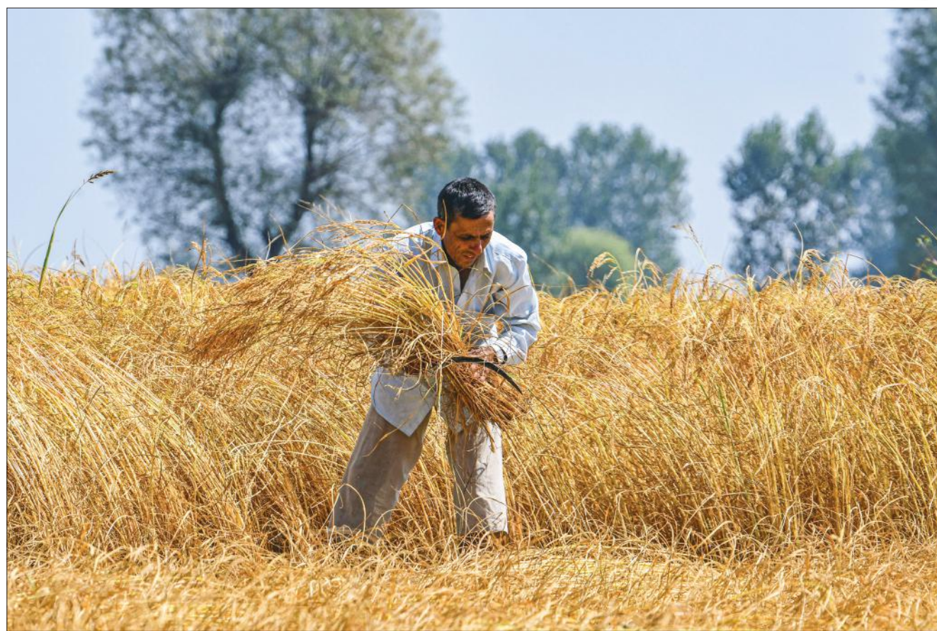
A farmer harvesting rice inside his paddy field in the South of Kashmir on Monday.

6 DEMOCRATIC IS FOR DEMOCRACY AND AZAD FOR INDEPENDENCE... The party will be democratic and not an autocratic one, the power will not remain in one hand and the provisions of the party's constitution will be based on total democracy."