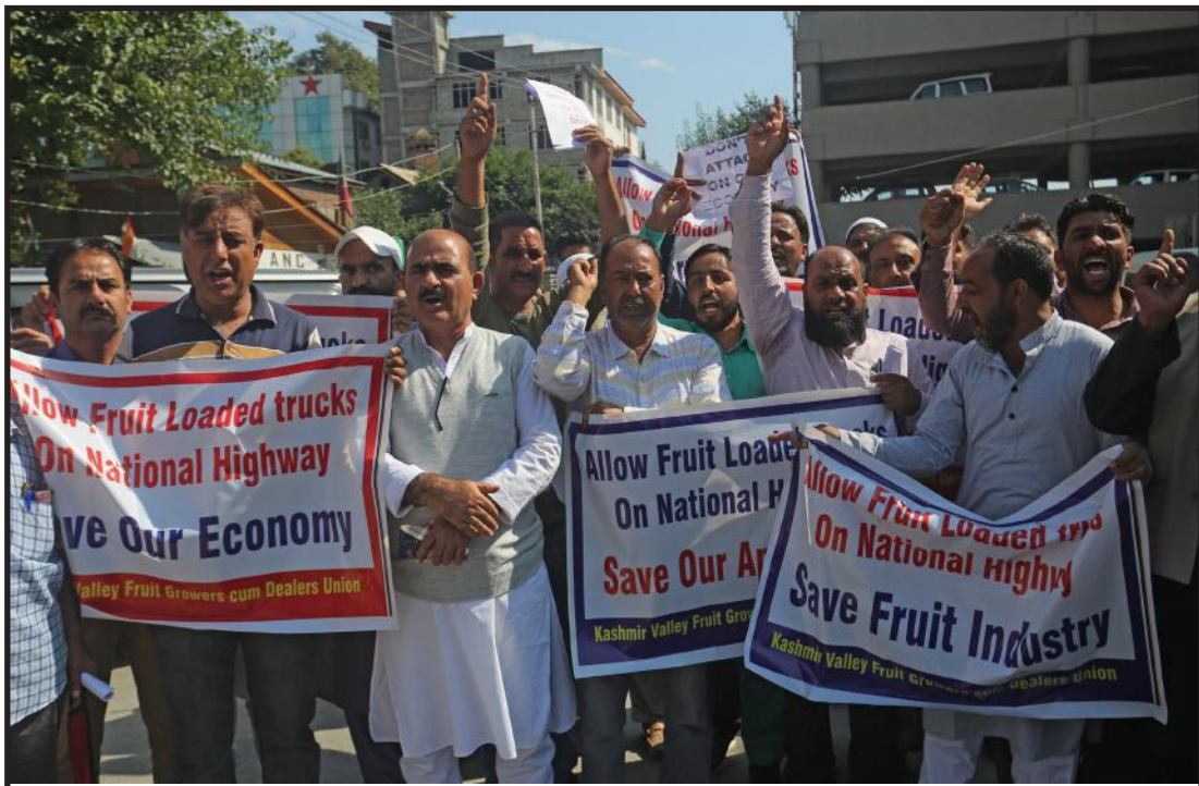
Kashmir farmers on Monday protested at Press colony against halting of Fruit trucks near Qazigund on the Srinagar-Jammu Highway.