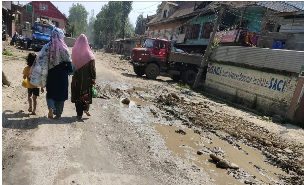
The residents of Khomeini Chowk, Bemina have urged the authorities to macadamize roads in the locality.

During the drive the Police Contingent from PCR, Police Station Nigeen was accompanying the drive.