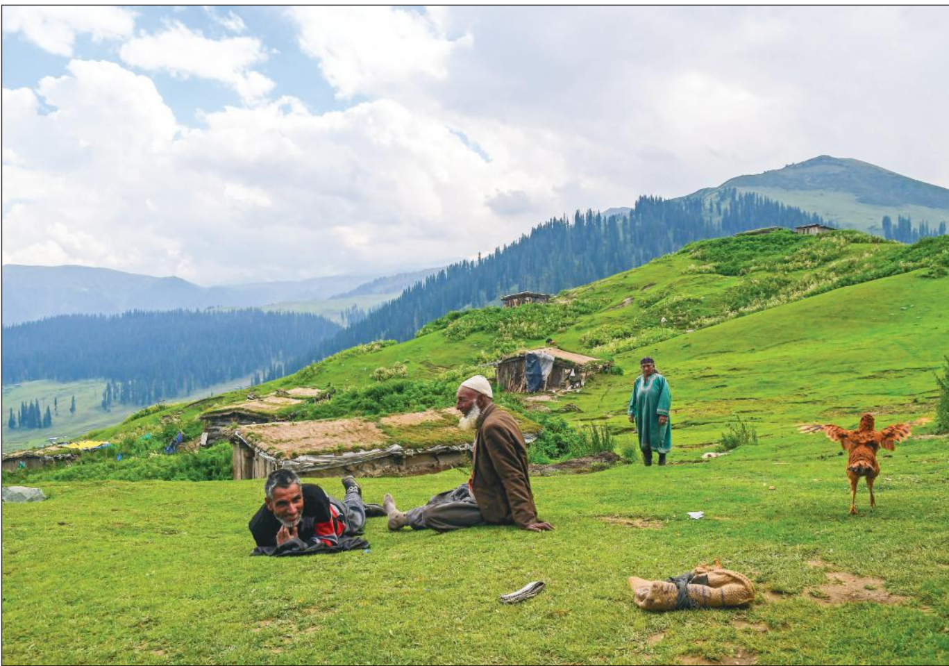
Two villagers enjoy warm sunlight in the scenic Tosa Maidan meadow of Budgam district on Saturday, as the mercury has started dropping ahead of autumn.