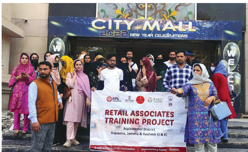
Four women trainees of IIFL Retail Associate Training Centre, Kupwara were successfully placed for jobs in Srinagar during their Industry Visit on 15 September 2022.

The relative humidity at 5.30 pm was recorded at 100 per cent, as per data shared by the IMD.