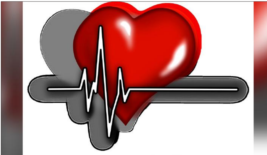
“This new technology is revolutionising how patients with heart disease are diagnosed. However, it takes up to 20 minutes to carry out