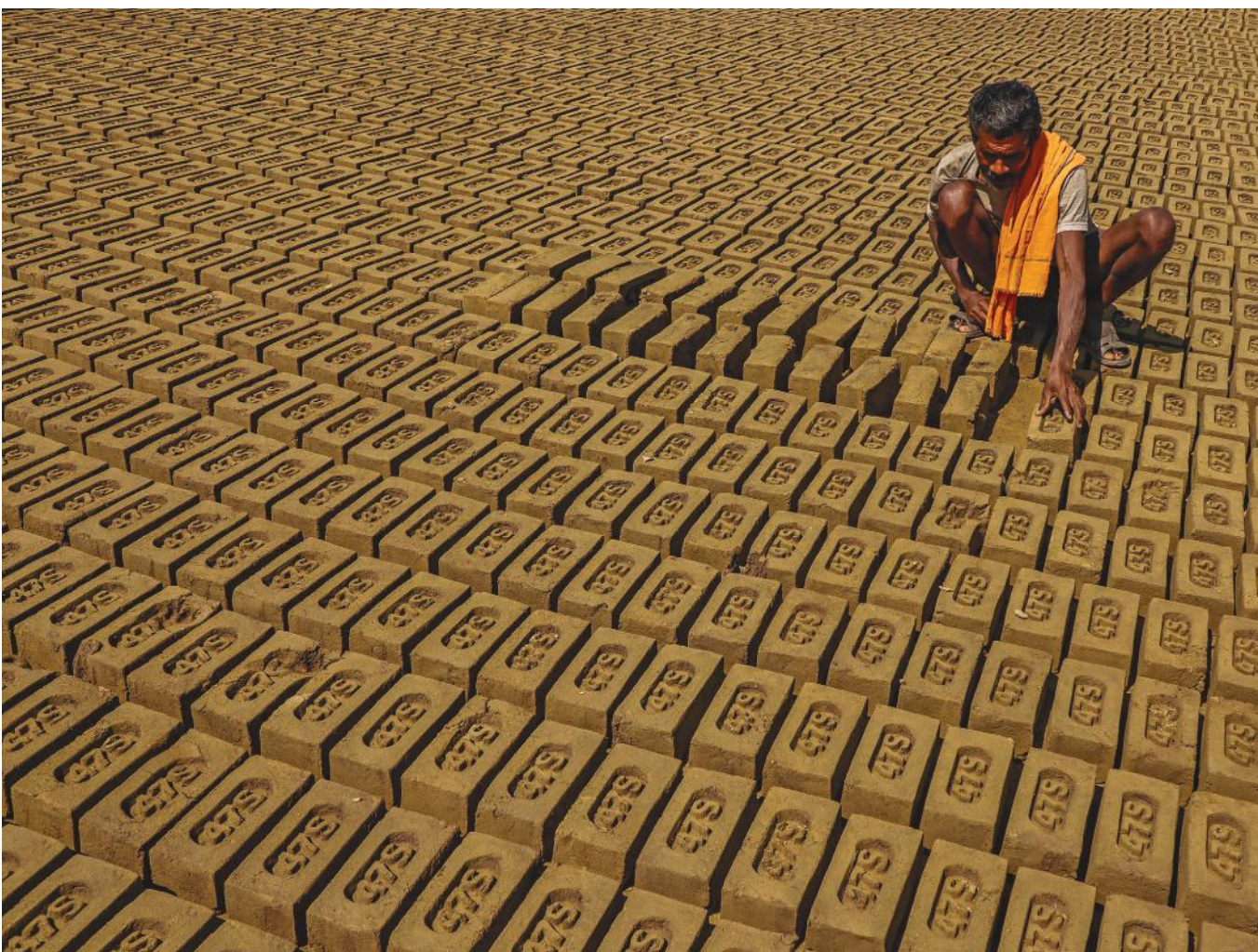
A migrant worker arranges bricks in a row at a brick kiln in Central Kashmir's Budgam district on Friday.

SEVERAL PETITIONS CHALLENGING THE CENTRE'S DECISION TO ABROGATE provisions of Article 370 and the Jammu and Kashmir Reorganisation Act, 2019, which split J-K into two Union Territories Jammu and Kashmir, and Ladakh were referred to a Constitution Bench headed by Justice Ramana in 2019 by the then CJI Ranjan Gogoi.