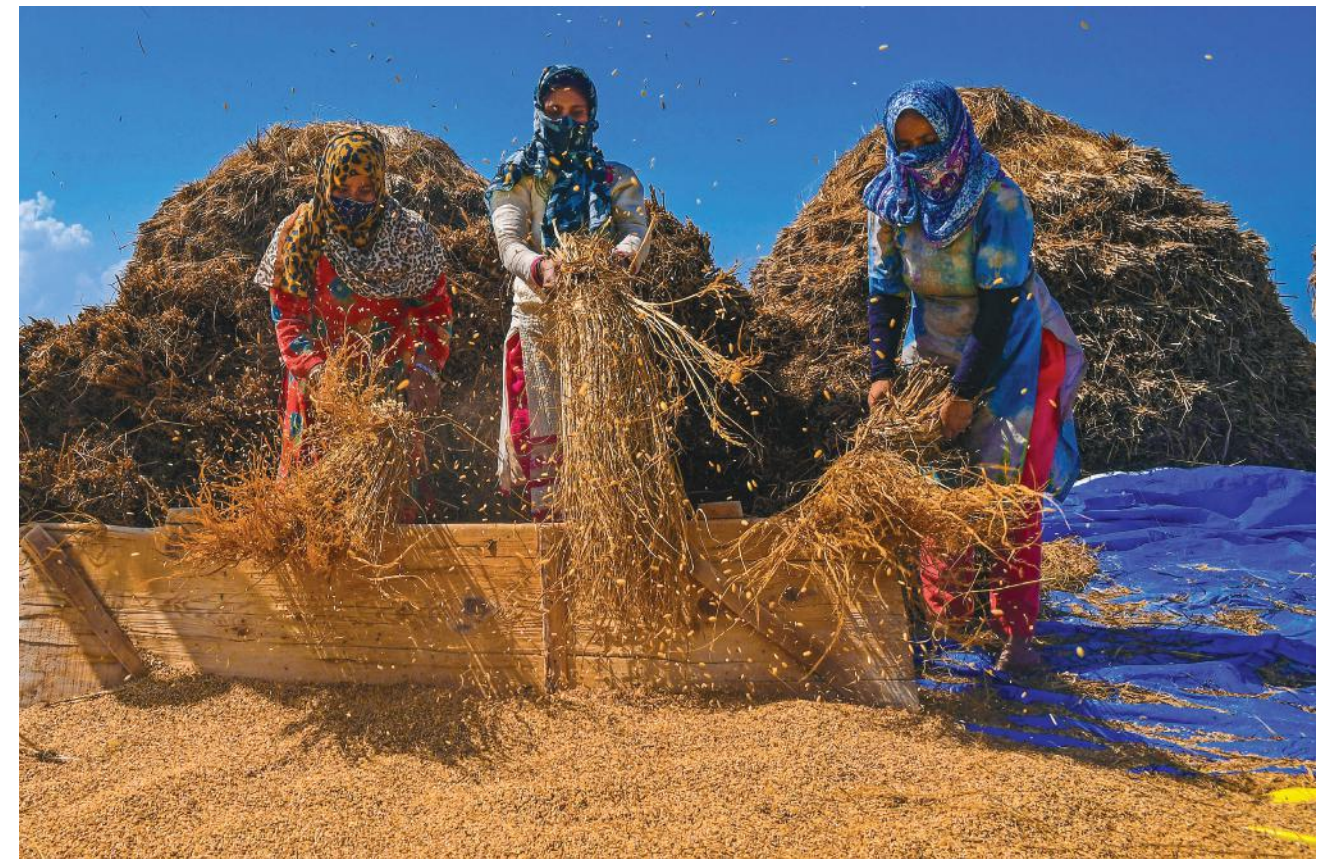
A group of women manually thrash rice crop at their paddy field in the outskirts of Srinagar on Monday.

On September 3, a 25-year-old madrassa teacher was arrested under Enemy Agents Ordinance Act' for allegedly More on P10