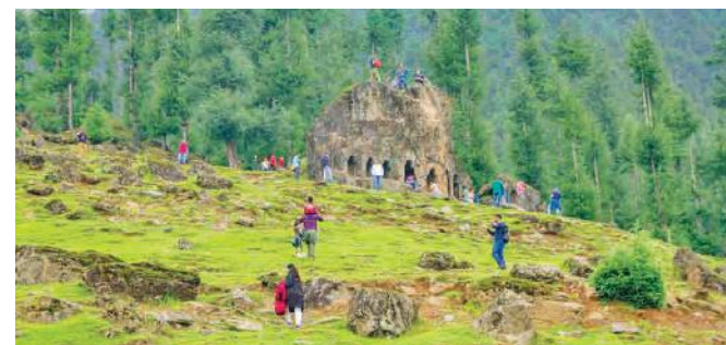
Observer News Service

181 Villages To Be Rejuvenated By Mission Youth Under This Programme