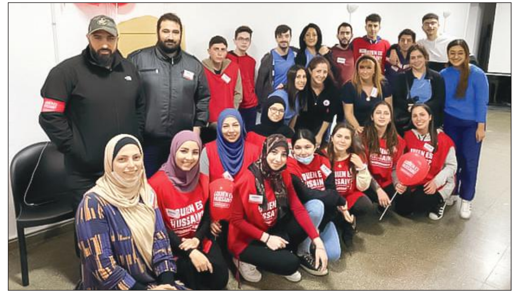
Team from Who Is Hussain in Buenos Aires, Argentina.

As part of the campaign, called #GlobalBloodHeroes, blood donation centres across the UK - and dozens of other centres in 27 countries including Argentina, Iraq, and Thailand – collected blood from more than 37,000 people. Donations began at a centre in New