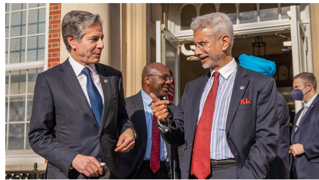
S Jaishankar with Antony Blinken in Washington.

New York: External Affairs Minister S Jaishankar has arrived here for the high-level UN General Assembly session, with a packed diplomatic week ahead that will include more than 50 official engagements including bilateral and multilateral meetings.