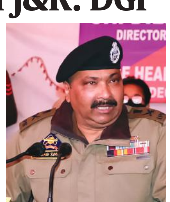
THE PEOPLE GAVE A TIGHT SLAP ON their bandh calls, which was evident from the fact that there was no strike on August 5.

I recently visited the remote Karnah and Keran along the Line of Control (in north Kashmir's