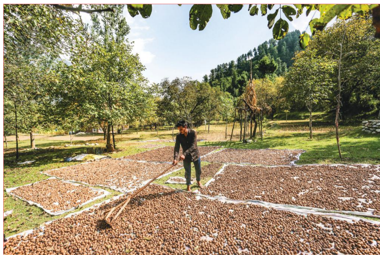
A man spreads freshly harvested walnuts for drying at his orchard in Tral area of Pulwama district.

TO SECURE THE BRIGHT FUTURE OF OUR YOUTH, Police and people have to work together. Past which has given pain has to be left behind so as to provide a peaceful environment to our coming generations."