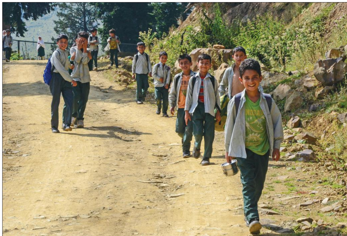
Students pass through a forest area after attending school in Khag area of the Budgam district on a hot summer day Wednesday.

The crimes registered against children in 2021 include seven cases of murder, a murder with rape, six other cases of murder, four cases of infanticide and three cases of foeticide. A total of 294 cases were registered under the Protection of Children from Sexual Offences Act in 2021, the report said. More on P6