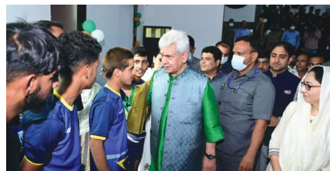
Ellahi Bagh Indoor Sports Stadium, constructed at a cost of Rs 4 cr under PMDP, an official spokesperson said. More on P6

Sinha made these remarks during the inauguration of the