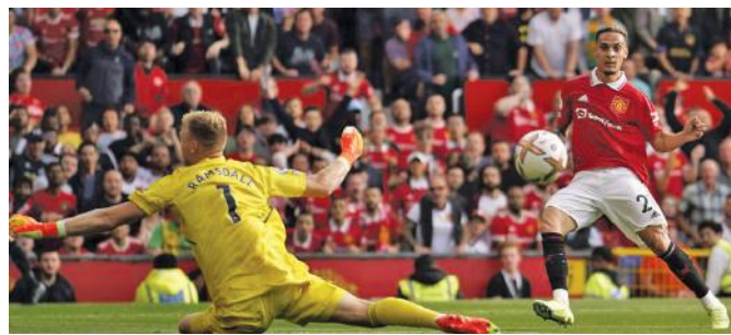
Manchester United debutant Antony, right, scores his side's opening goal past Arsenal's Aaron Ramsdale on Sunday. United won 3-1 to end the Gunner's winning streak.

Dinamo Zagreb vs Chelsea, Dortmund vs Copenhagen, FC Salzburg vs AC Milan, RB Leipzig vs Shakhtar Donetsk, Benfica vs Maccabi Haifa FC, Ajax vs Rangers and Frankfurt vs Sporting CP complete the opening day matches schedule.