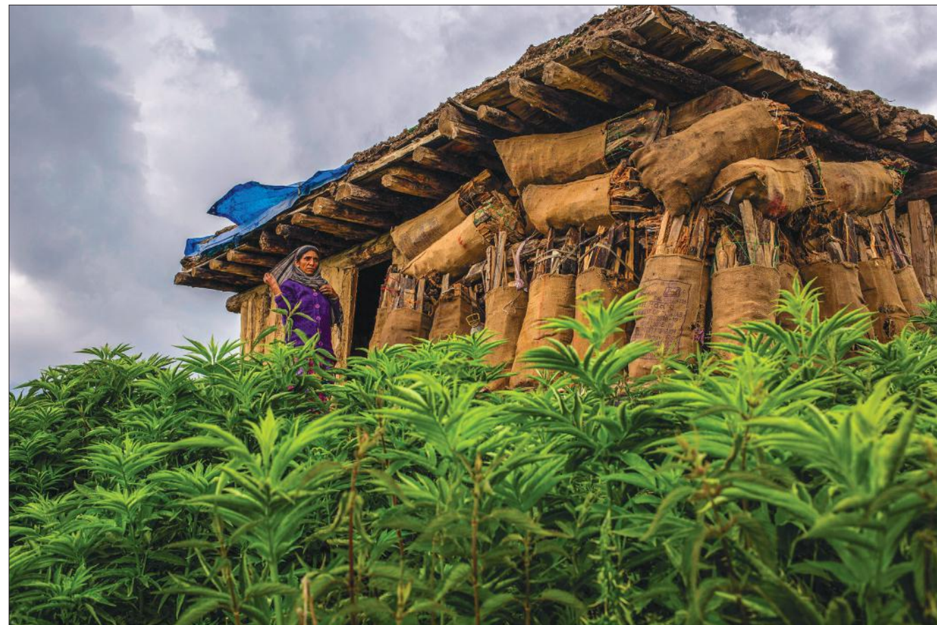
A woman roams around her wooden hut on a cloudy day in Tosa Maidan meadow in central Kashmir's Budgam district.

"No religion allows to target a person who leaves More on P6