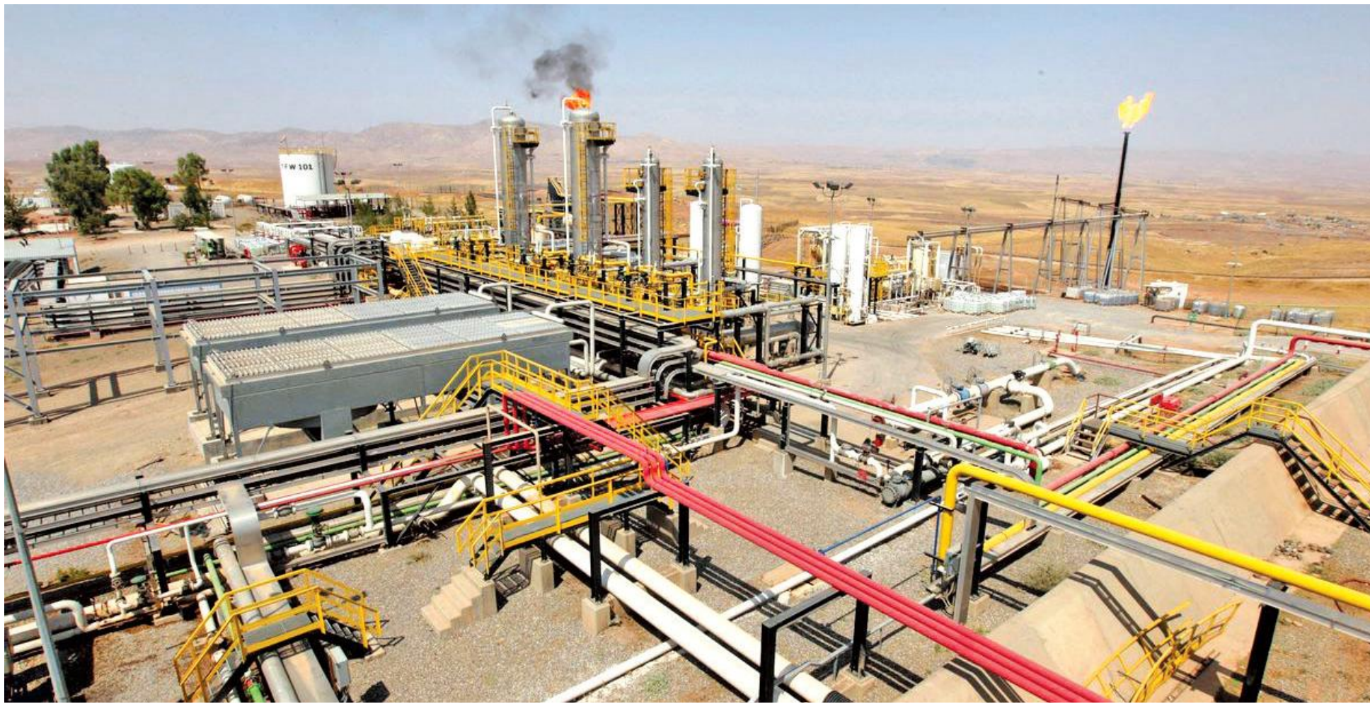
A flame rises from a chimney at Taq Taq oilfield in Erbil, in Iraq's Kurdistan region, August 16, 2014.