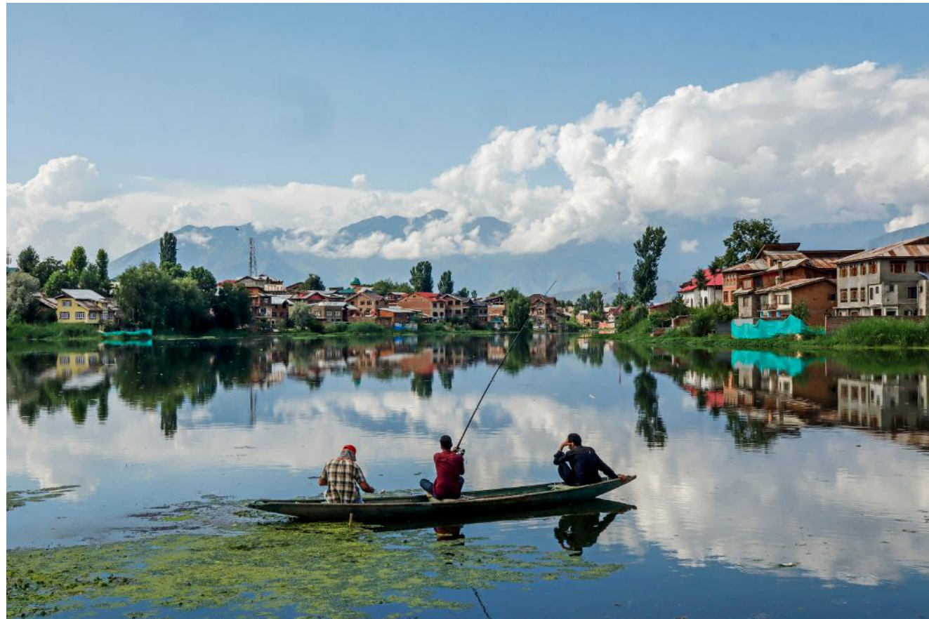
Seated inside a boat, three youths try their luck in fishing in the middle of Khushal Sar wetland in Srinagar on Thursday.