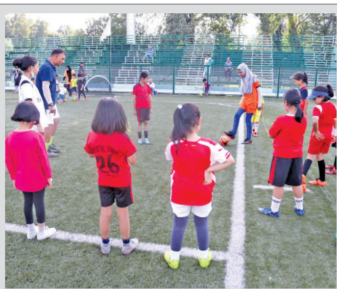
THE FUTURE: Young football players learn how to stop the ball during a training session of J&K Sports Council's 'Open Football School' at Synthetic Turf TRC on Wednesday.