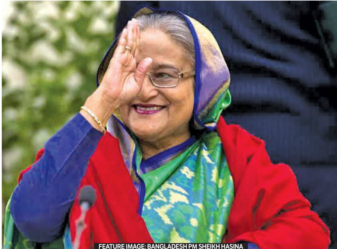
FEATURE IMAGE: BANGLADESH PM SHEIKH HASINA

The author is an Gauhati is a India based researcher in Gauhati University