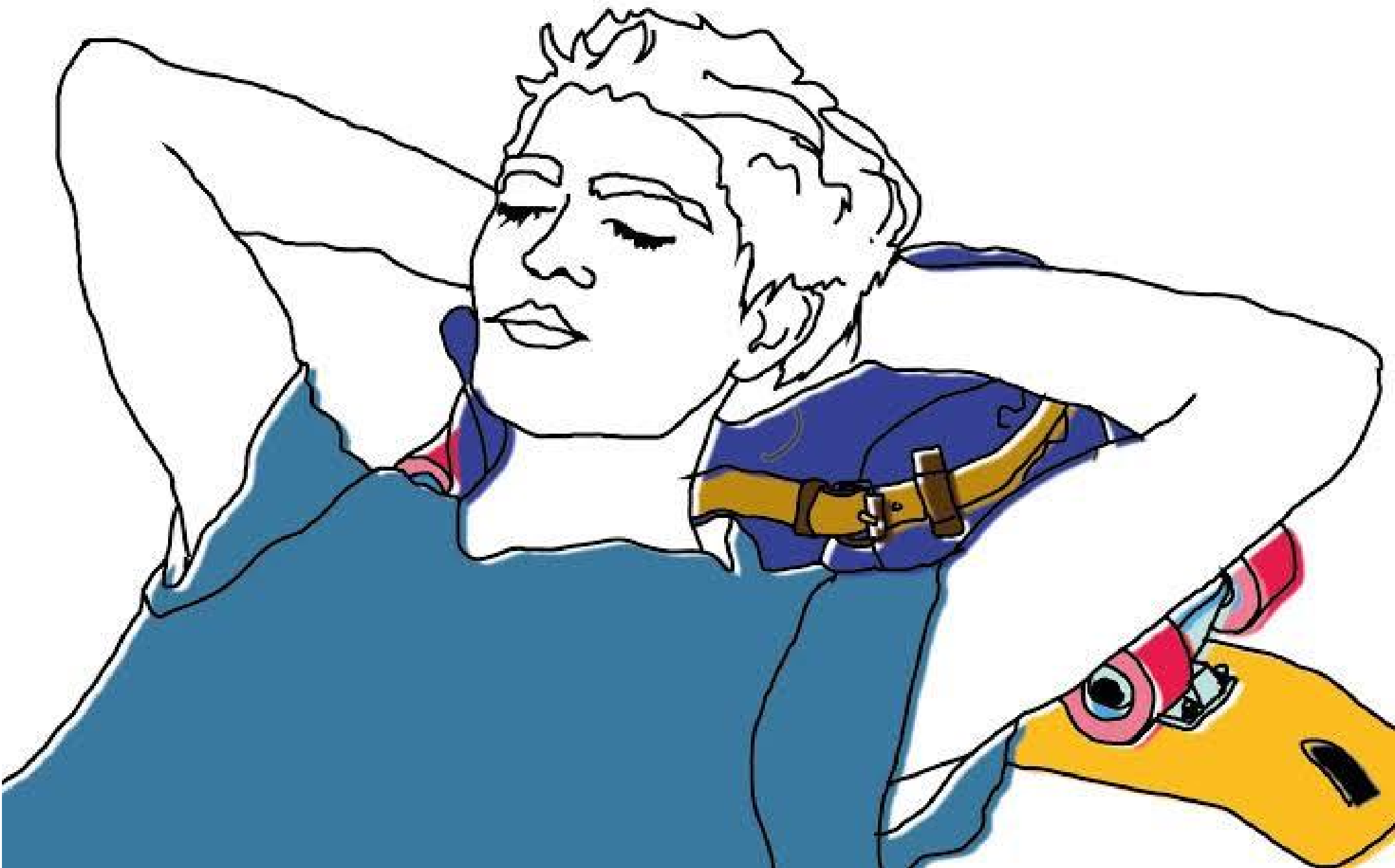
Illustration Source: The Mix