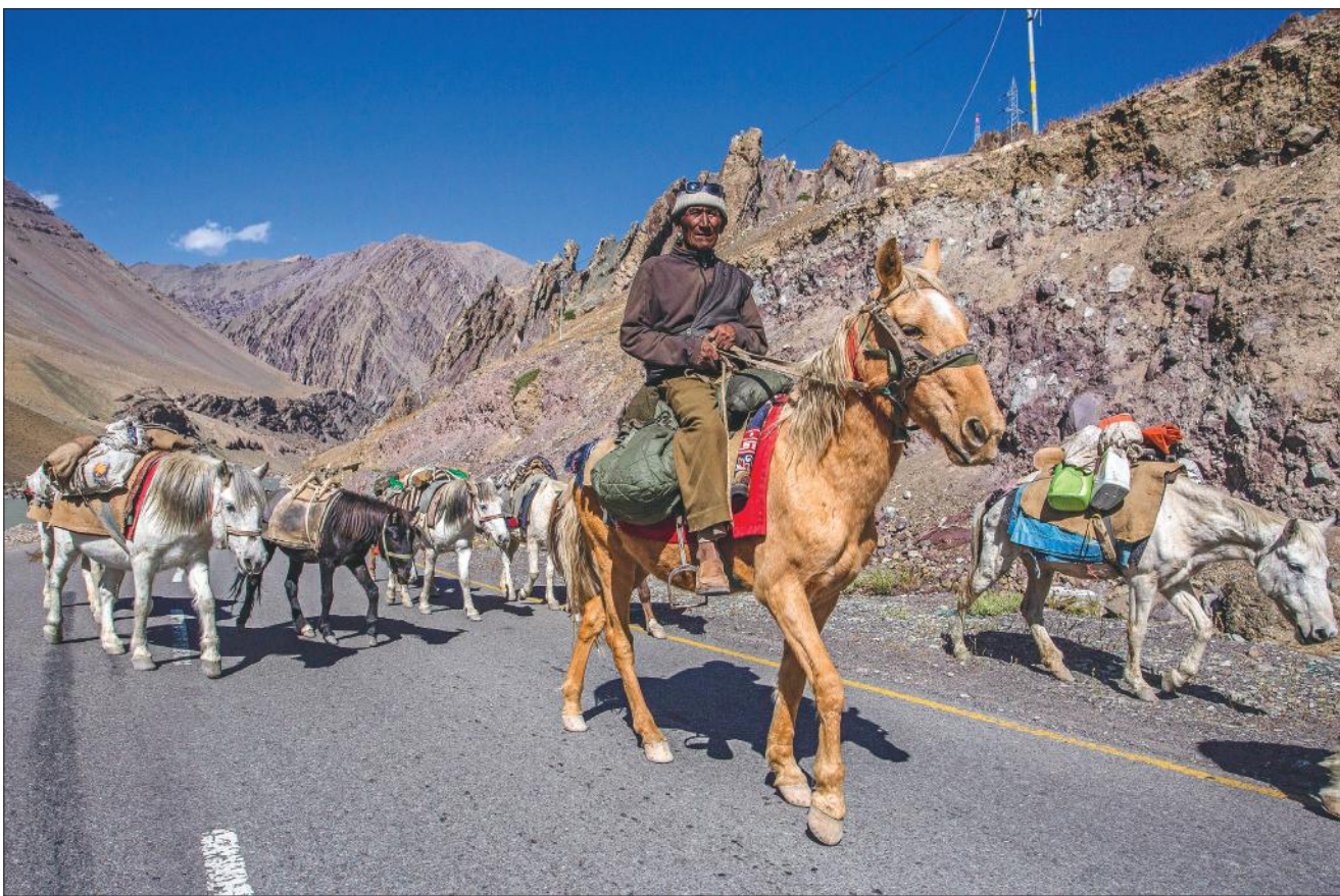
An elderly man carrying supplies on his horses in a remote village of mountainous Union Territory of Ladakh.

He appreciated the efforts of the security agencies and administration of the Union Territory of Jammu and Kashmir for the successful conduct of the Amarnath Yatra this year, which was held after a More on P6