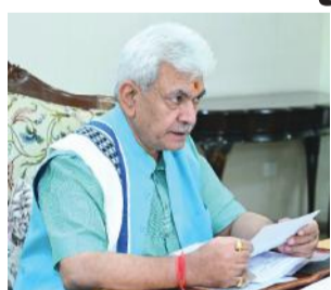
The LG was interacting with the applicants of JK-IGRAMS during the "LG's Mulaqaat- Live Public Grievance Hearing" at the Civil Secretariat, where he

Srinagar: The Jammu and Kashmir Lieutenant Governor, Manoj Sinha said on Wednesday that people's participation is vital, inseparable part of a seamless and robust governance system, besides removing social ills from the society.