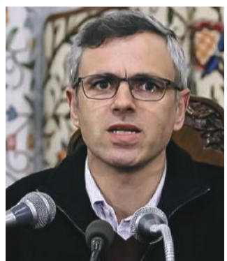
PAGD constituents," he added.

"They felt that it does not contribute to the overall unity of the amalgam. They denounced the unfair treatment meted out to JKNC in PAGD. The participants demanded immediate course correction from