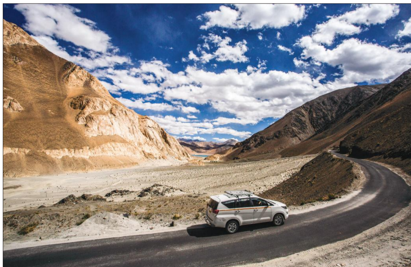
A tourist cab passes through a curvy road on a bright sunny day in the mountainous Union Territory of Ladakh.

"All this has triggered fears of demographic flooding and political disempowerment within the public. We are yet to ascertain if the final electoral rolls are also to include those ordinarily residing voters. Our concerns with regards to requirements for outsiders to get registered continue to remain unmet. The clarity provided by government quarters More on P6