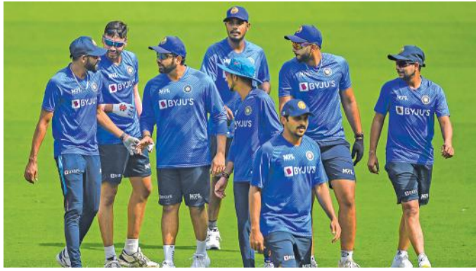
Press Trust of India

NEW DELHI: The Indian men's team will be playing a whopping 141 bilateral international matches during the next five-year Future Tours & Programme (FTP) Cycle between May, 2023 to April, 2027, the ICC said on Wednesday.