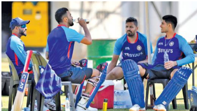
Press Trust of India

HARARE: Skipper KL Rahul's form and fitness will be observed keenly when India take on Zimbabwe in a three-match series, starting Thursday, in 50-over format, which is fast losing popularity and struggling to retain its identity.