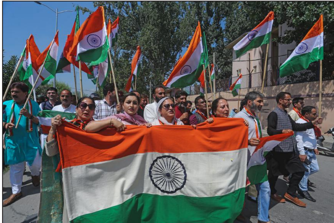
Members of Bharatiya Janata Party participate in a Tiranga Rally, organized as part of 'Azadi Ka Amrit Mahotsav' celebrations in Srinagar on Saturday.