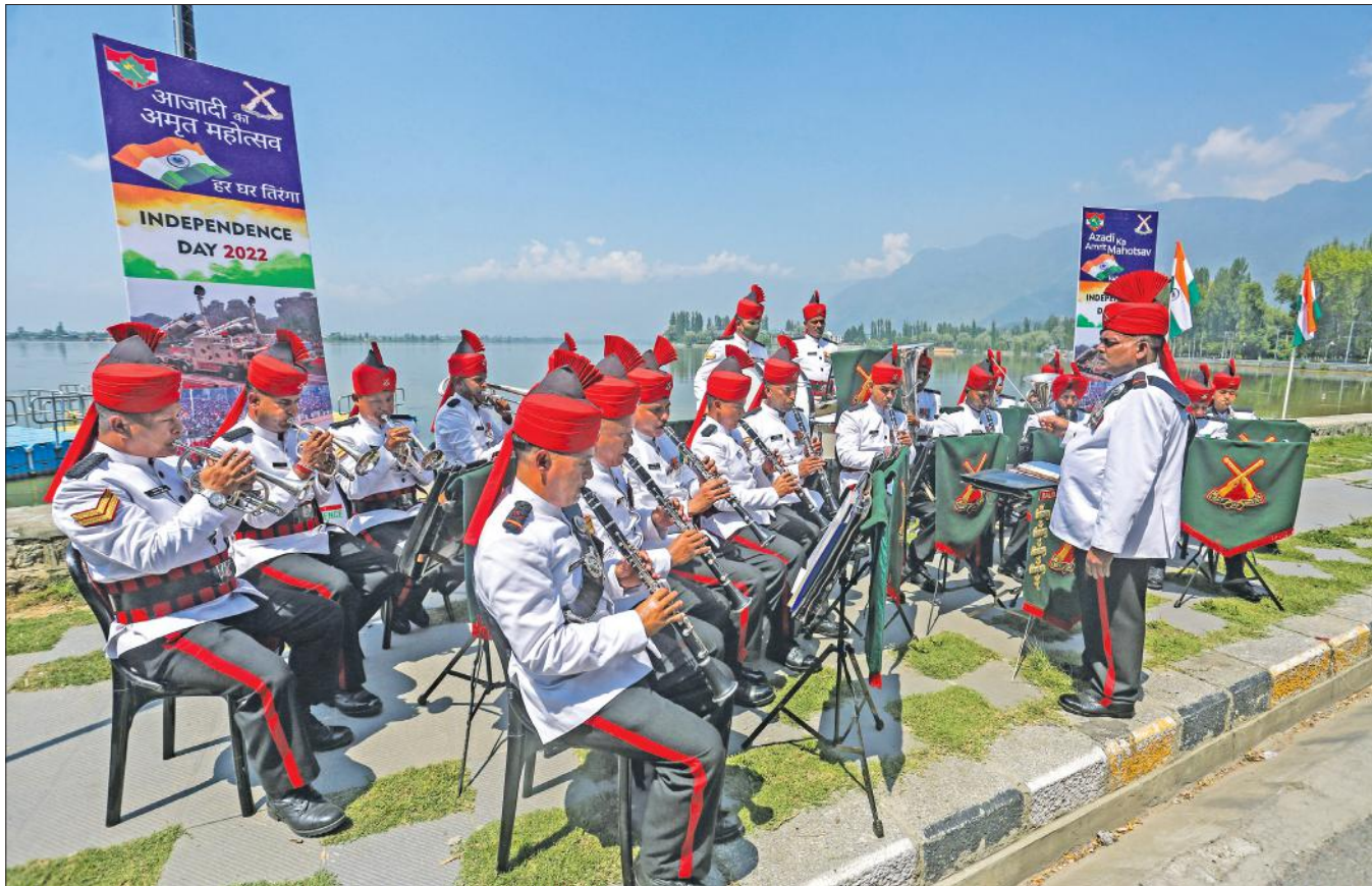
A live band performance organized by JAKLI enthralled the audience along the banks of Dal Lake in Srinagar on Saturday.

"A multi-layer security arrangement has been put in place to secure the venue of the main 15 August function at the Sher-e-Kashmir Cricket Stadium," a police official told Kashmir Observer. More on P6