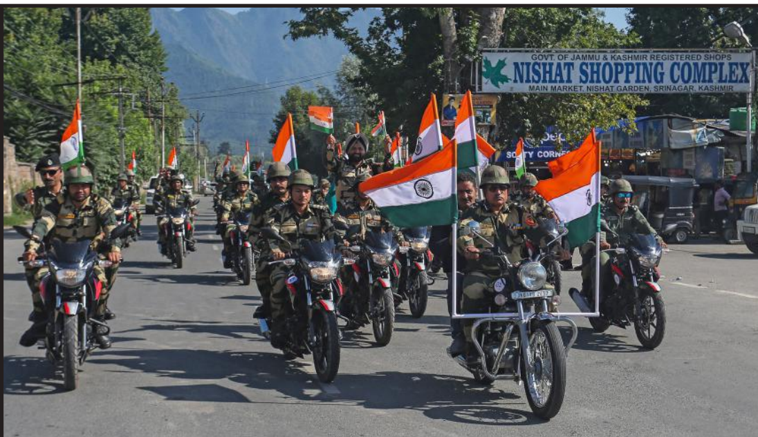
The Border Security Personnel (BSF) organized a Tiranga Motorcycle rally On Wednesday as a part of the Har Ghar Tiranga Campaign.

The operation was in progress till the filing of this report. (KNT)