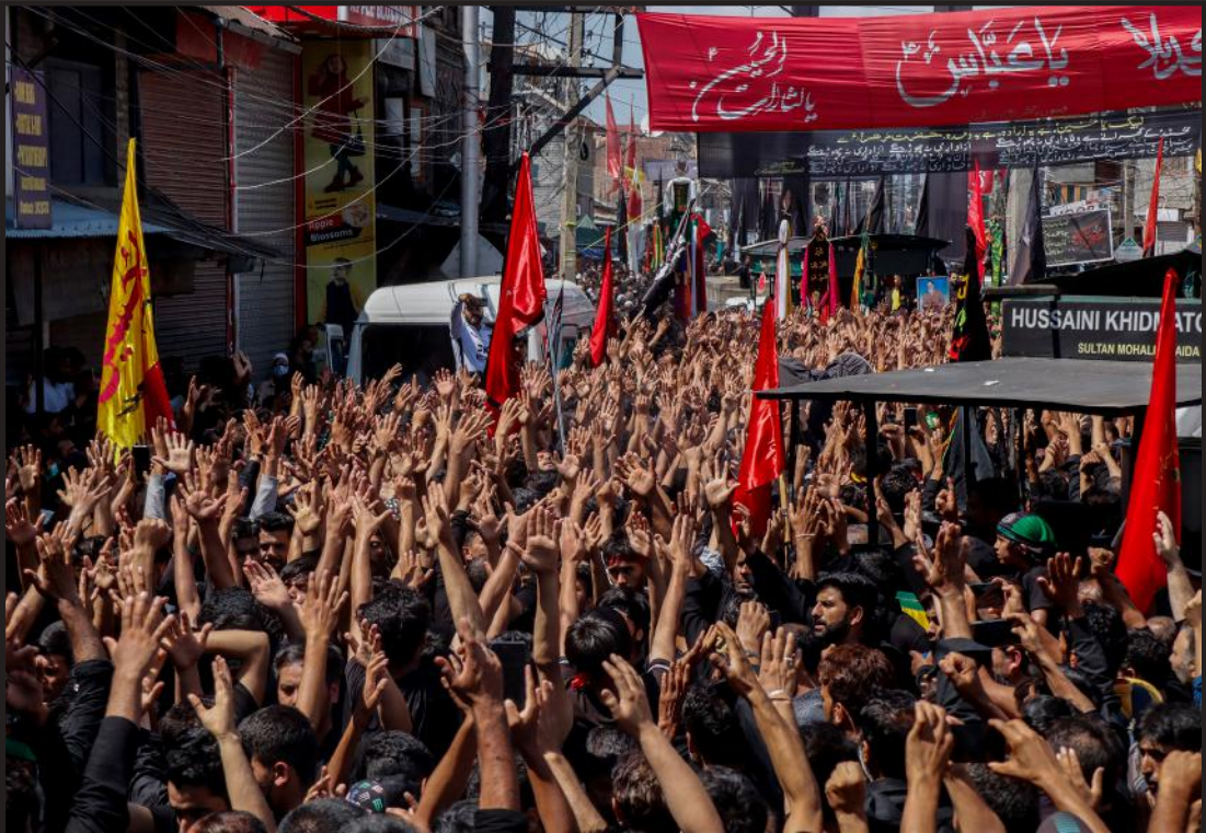
Thousands of people participated in the Ashura procession in the Zadibal locality of the city on Tuesday.