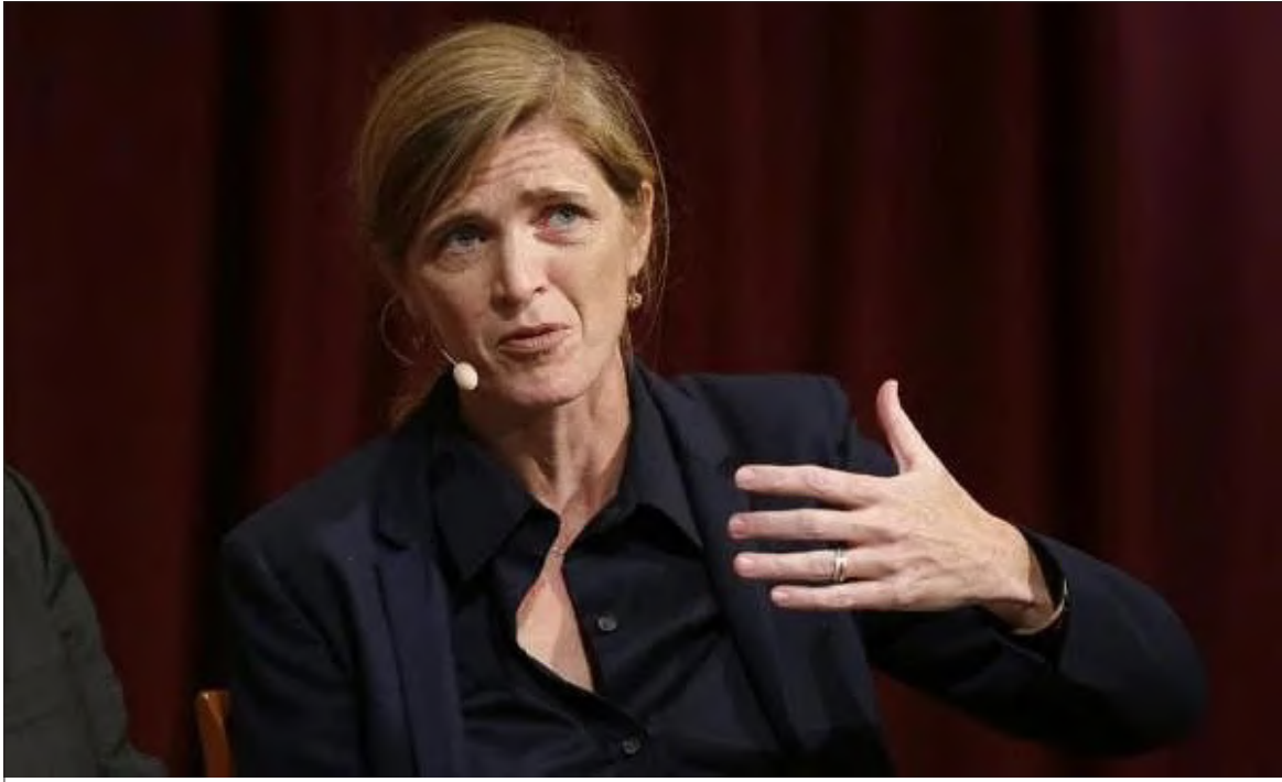
Newly-appointed USAID Administrator Samantha Power.