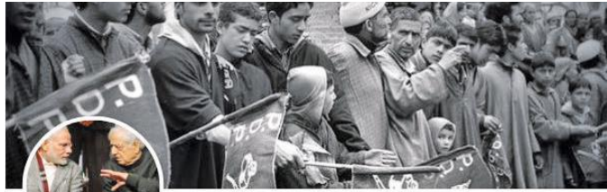
Mehbooba Mufti @MehboobaMufti