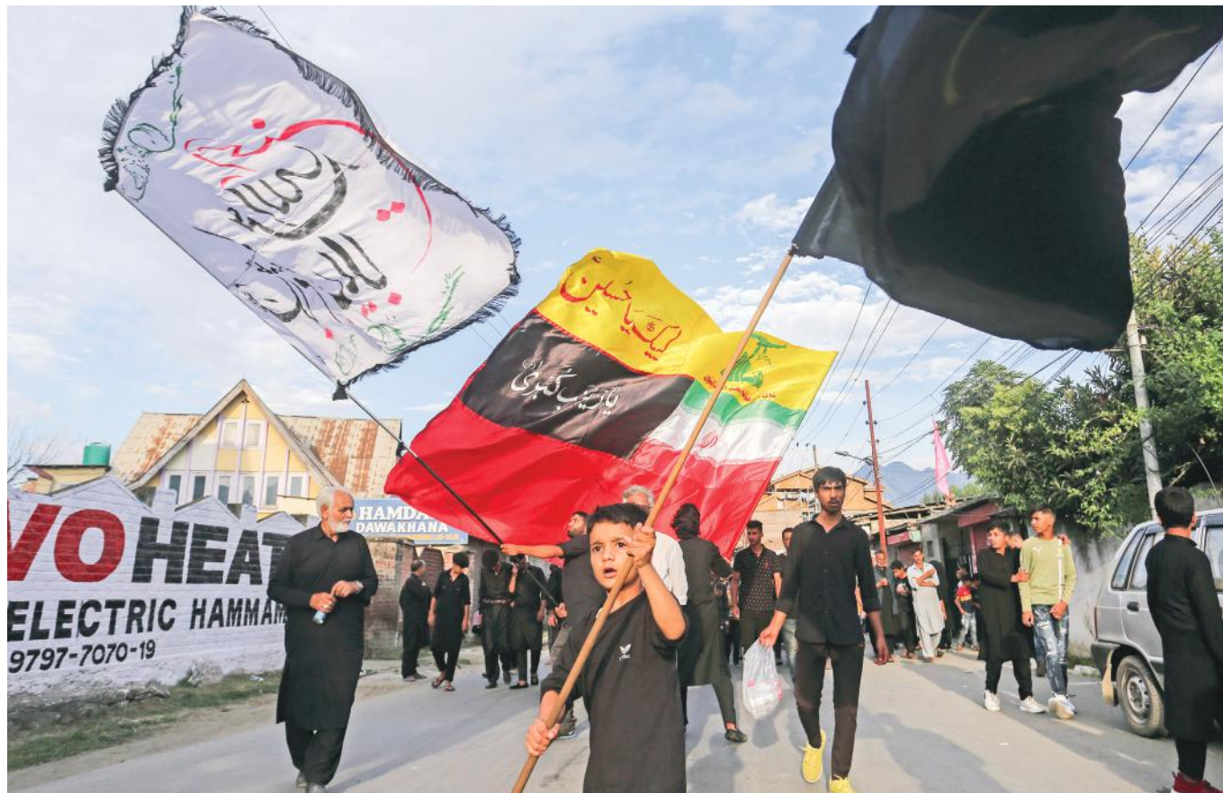
Mourners wave flags inscribed with 'Labbaik Ya Hussain' during a procession on the fourth day of Muharram in Srinagar on Wednesday.

Besides this, Noida based media group More on P6