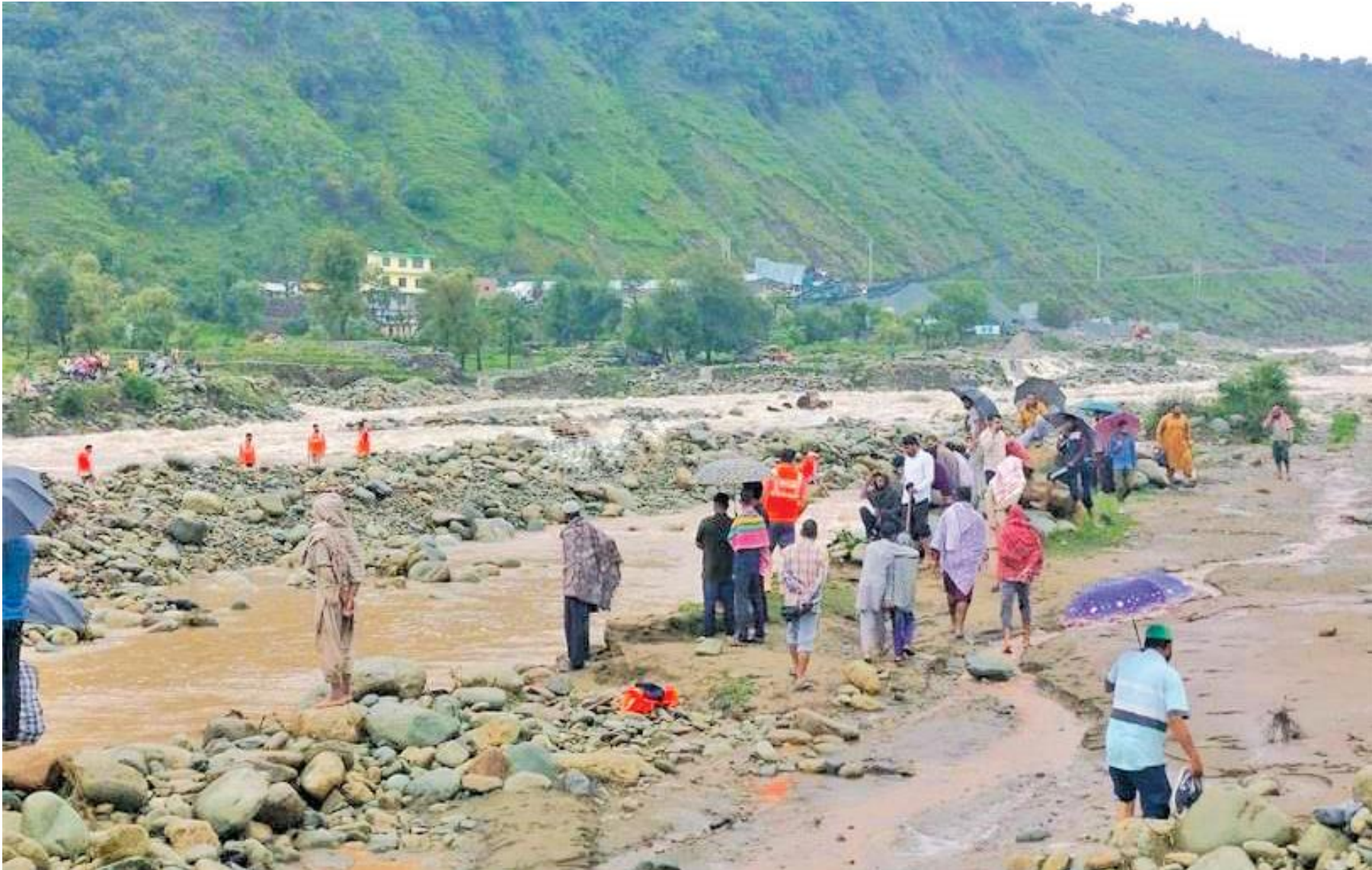
IN THE MONTH OF JULY ALONE, Kashmir Valley Witnessed Three Cloudbursts And A Dozen Flash Floods.

The increasing disasters speak for themselves. Policymakers, humanitarian and development organizations alike need to address, prevent and lessen the fatal impact of climate change before it's too late