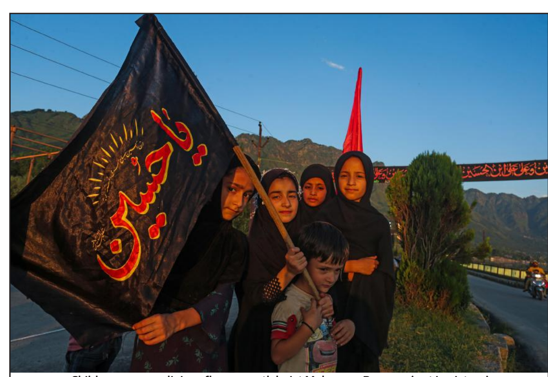
Children wave a religious flag as youth hoist Muharram Banners (not in picture) on Foreshore road in Srinagar.